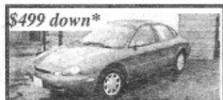
$499 down* 96 Taurus. Runs Great