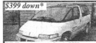
$399 down* 95 Transport, Low Mileage