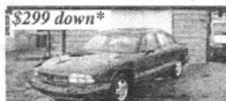
$299 down* 92 Olds 88 Runs Great