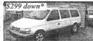
$299 down* 95 Caravan, SE NICE