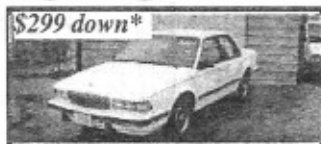
$299 down* 91 Century Nice Car