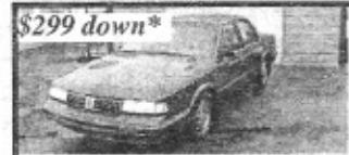
$299 down* 96 Cierra. Runs Great