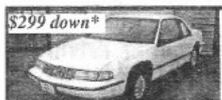
$299 down* 90 Lumina V6, auto