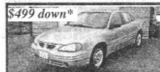
$499 down* 99 Grand Am Gas Saver