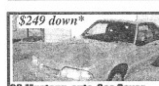
93 Mustang, auto, Gas Saver

Se Habla Espanol Marty's Auto Sales 986-2222 Se Habla Espanol