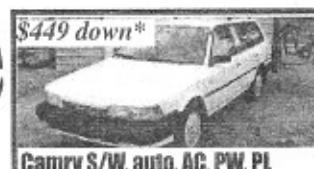
Camry S/W, auto, AC, PW, PL