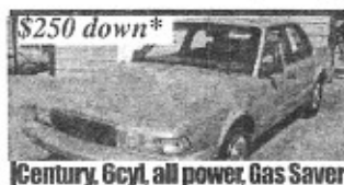
Century, 6cyl, all power, Gas Saver