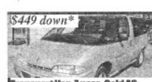
Transport Van, 7 pass, Cold AC