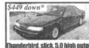
Thunderbird, slick, 5.0 high output