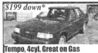
Tempo, 4cyl, Great on Gas