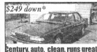
Century, auto, clean, runs great