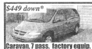
Caravan, 7 pass. factory equip.