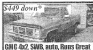
GMC 4x2, SWB, auto, Runs Great

MARTY'S AUTO SALES • 986-2222 • MARTY'S AUTO SALES • 986-2222 • MARTY'S AUTO SALES • 986-2222 • MARTY'S AUTO SALES • 986-2222 • MARTY'S AUTO SALES • 986-2222