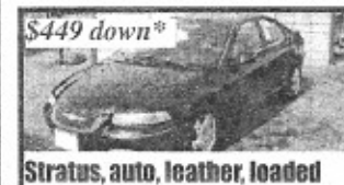
Stratus, auto, leather, loaded