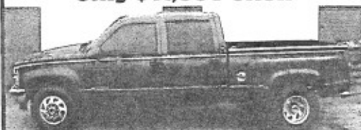
2000 Chevy 3500, Crew Cab, 4dr, 4x4, dually, LS, all power, loaded, auto, V8, NADA $14,500 only $11,500*