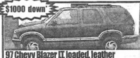
97 Chevy Blazer LT, loaded, leather

Largest Inventory Ever! Means Biggest Savings