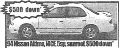
94 Nissan Altima, NICE, 5sp, sunroof, $500 down*

Best Time To Save! Cars as low as $300 down*