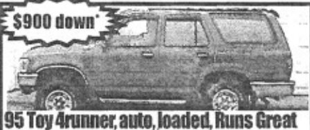
95 Toy 4runner, auto, loaded, Runs Great

LENOIR CITY AUTO SALES • 986-4411 • LENOIR CITY AUTO SALES • 986-4411 • LENOIR CITY AUTO SALES • 986-4411 • LENOIR CITY AUTO SALES • 986-4411 • LENOIR CITY AUTO SALES • 986-4411 • LENOIR CITY AUTO SALES • 986-4411