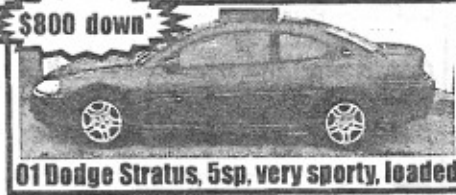
01 Dodge Stratus, 5sp, very sporty, loaded

Best Time To Save! Cars as low as $300 down*