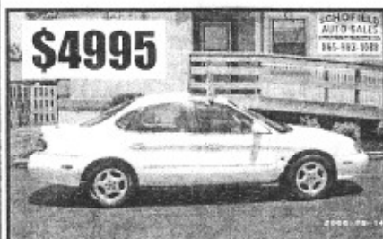
1999 Ford Taurus SE Top of the line Must see to appreciate