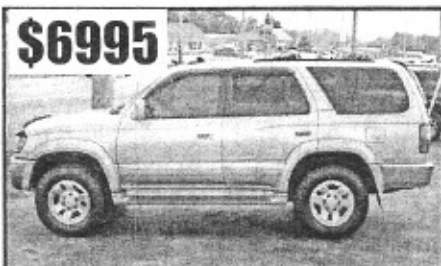
1997 Toyota 4Runner LIMITED 4X4, X-tra clean, Loaded