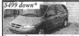
$499 down* Caravan, 7 pass. factory equip.