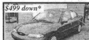
$499 down* Contour, auto, Acyl, Nice Car

$250 DOWN* IS ALL YOU NEED THIS WEEK ONLY ANY CAR