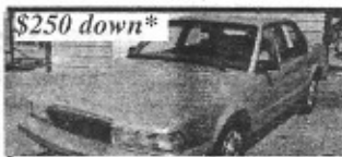
$250 down* Century, 6cyl, all power, Gas Saver