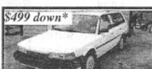
$499 down* Camry S/W, auto, AC, PW, PL