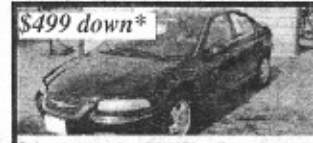
$499 down* Stratus, auto, leather, loaded