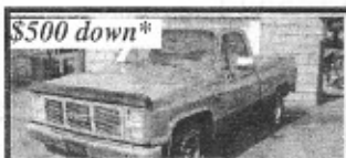
$500 down* GMC 4x2, SWB, auto, Runs Great

MARTY'S AUTO SALES • 986-2222 • MARTY'S AUTO SALES • 986-2222 • MARTY'S AUTO SALES • 986-2222 • MARTY'S AUTO SALES • 986-2222 • MARTY'S AUTO SALES • 986-2222