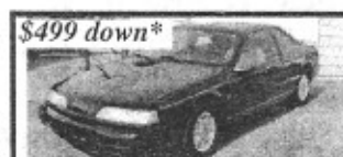
$499 down* Thunderbird, slick, 5.0 high output

$250 DOWN* IS ALL YOU NEED THIS WEEK ONLY ANY CAR