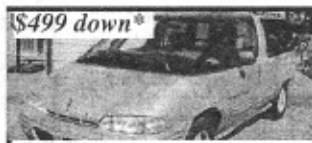
$499 down* Transport Van, 7 pass, Cold AC