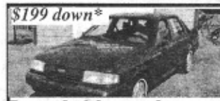
$199 down* Tempo, 4cyl, Great on Gas