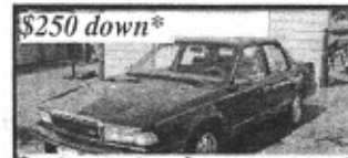
$250 down* Century, auto, clean, runs great