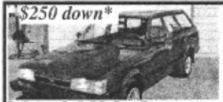
$250 down* Subaru 4x4, AC, Gas Saver.

Payments As Low As $59 a week* HURRY! These Deals Won't Last!!!