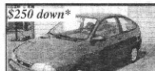
$250 down* Aspire, auto, Gas Saver