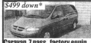
$499 down* Caravan, 7 pass, factory equip.