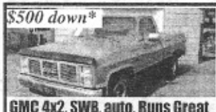
$500 down* GMC 4x2, SWB, auto, Runs Great

MARTY'S AUTO SALES • 986-2222 • MARTY'S AUTO SALES • 986-2222 • MARTY'S AUTO SALES • 986-2222 • MARTY'S AUTO SALES • 986-2222 • MARTY'S AUTO SALES • 986-2222