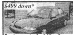
$499 down* Contour, auto, 4cyl, Nice Car