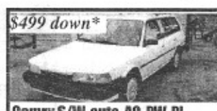
$499 down* Camry S/W, auto, AC, PW, PL