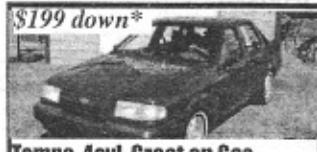
$199 down* Tempo, 4cyl, Great on Gas