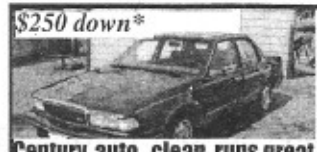
$250 down* Century, auto, clean, runs great