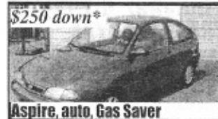
$250 down* Aspire, auto, Gas Saver