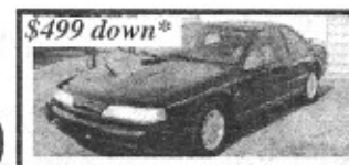
$499 down* Thunderbird, slick, 5.0 high output