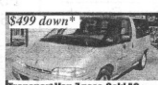
$499 down* Transport Van, 7 pass, Cold AC