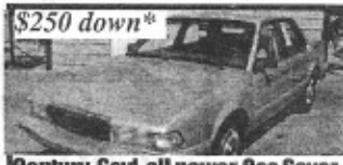
$250 down* Century, 6cyl, all power, Gas Saver

$250 DOWN* IS ALL YOU NEED THIS WEEK ONLY ANY CAR