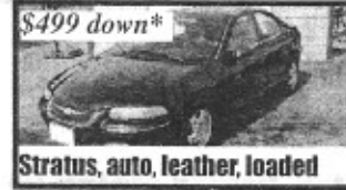
$499 down* Stratus, auto, leather, loaded