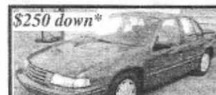
$250 down* Lumina, V6, auto, AC, Runs Great