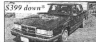
$399 down* Dynasty, Ex. Clean, Runs Great