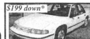
$199 down* Lumina, Runs Great, Factory Equip