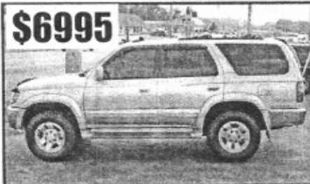
$6995 1997 Toyota 4Runner LIMITED 4X4, X-tra clean, Loaded