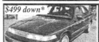
$499 down* Crown Vic, All Power Equip, Nice