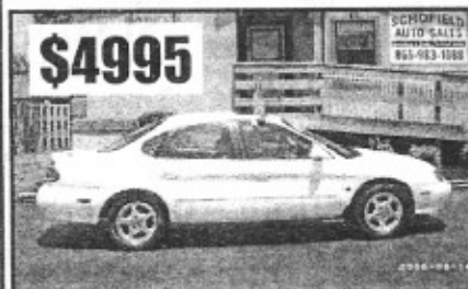
$4995 1999 Ford Taurus SE Top of the line Must see to appreciate