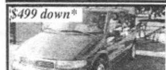
$499 down* Villager, Loaded, V6, Extra Clean