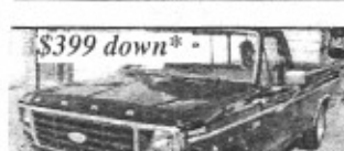
$399 down* F150, 4x2, auto, Runs Great, 6 cyl

Payments As Low As $59 a week* HURRY! These Deals Won't Last!!!