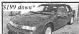
$199 down* Cougar, auto, All Pwr, Runs Great

MARTY'S AUTO SALES • 986-2222 • MARTY'S AUTO SALES • 986-2222 • MARTY'S AUTO SALES • 986-2222 • MARTY'S AUTO SALES • 986-2222 • MARTY'S AUTO SALES • 986-2222