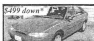
$499 down* Escort, auto, Great Gas Saver