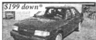
$199 down* Tempo, 4cyl, Great on Gas