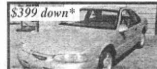
$399 down* T-Bird, auto, all power equip.