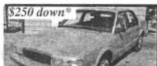
$250 down* Century, 6cyl, all power, Gas Saver

$250 Down* IS ALL YOU NEED THIS WEEK ONLY ANY CAR