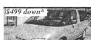
$499 down* Transport Van, 7 pass, Cold AC