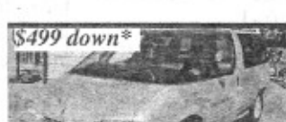
$499 down* Transport Van, 7 pass, Cold AC