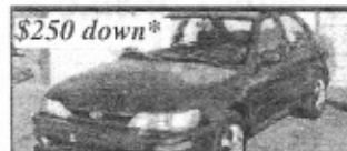
$250 down* Corolla, Gas Saver, 5sp, AC