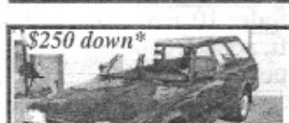
$250 down* Subaru 4x4, AC, Gas Saver,

Payments As Low As $59 a week* HURRY! These Deals Won't Last!!!