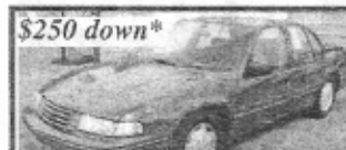
$250 down* Lumina, V6, auto, AC, Runs Great