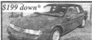
$199 down* Cougar, auto, All Pwr, Runs Great

MARTY'S AUTO SALES • 986-2222 • MARTY'S AUTO SALES • 986-2222 • MARTY'S AUTO SALES • 986-2222 • MARTY'S AUTO SALES • 986-2222 • MARTY'S AUTO SALES • 986-2222