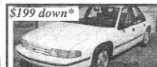
$199 down* Lumina, Runs Great, Factory Equip