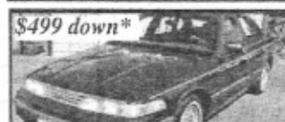
$499 down* Crown Vic, All Power Equip, Nice