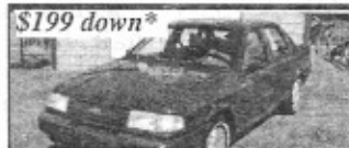
$199 down* Tempo, 4cyl, Great on Gas