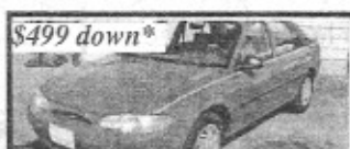
$499 down* Escort, auto, Great Gas Saver