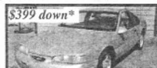
$399 down* T-Bird, auto, all power equip.