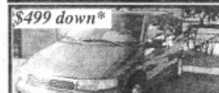
$499 down* Villager, Loaded, V6, Extra Clean