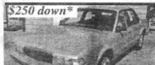
$250 down* Century, 6cyl, all power, Gas Saver

$250 DOWN* IS ALL YOU NEED THIS WEEK ONLY ANY CAR