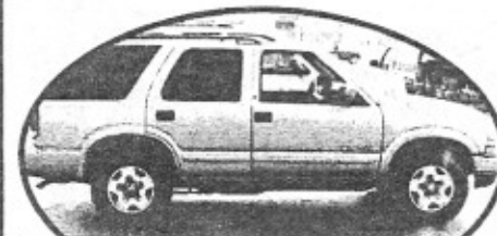
2002 Chevy Blazer, 4dr, auto, V6, 4x4 $500 Down cash or trade