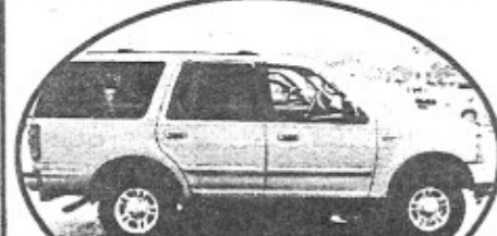
2001 Ford Expedition, 4x4, third seat, Low Miles