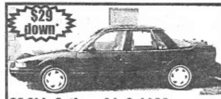
$29 down 92 Olds Cutlass, 4dr, Cold AC

SCORE with Low Down Payments & Low Weekly Payments