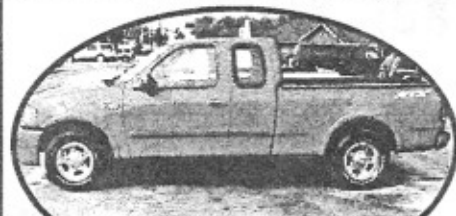
2003 Ford F150 SXT, auto, AC, PS, PB, V6 $10,995

(865) 986-2200 cell (865) 207 2893 e-mail: bobmccurry@aol.com