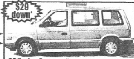
$29 down 93 Dodge Caravan, 7 pass.

SCORE with Low Down Payments & Low Weekly Payments