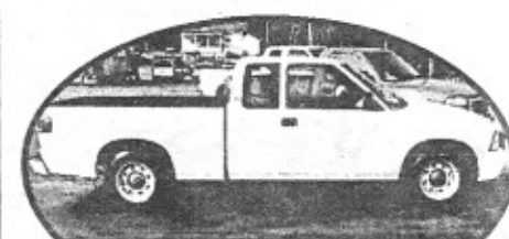
2003 GMC Sonoma, 5sp, AC $8995