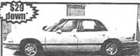
$29 down 93 Buick Lesabre, 4dr, luxury

Lenoir City AUTO SALES It's Football Time in Tennessee!!!