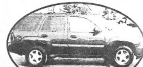
2004 Chevy Trailblazer, auto, AC, 4 door, Full Power, Low Payments!