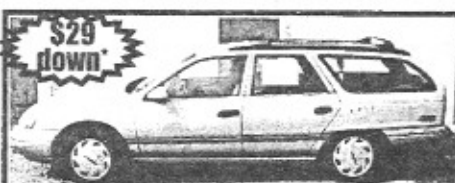
$29 down 92 Taurus S/W Roomy & Ready

LENOIR CITY AUTO SALES • 986-4411 • LENOIR CITY AUTO SALES • 986-4411 • LENOIR CITY AUTO SALES • 986-4411 • LENOIR CITY AUTO SALES • 986-4411 • LENOIR CITY AUTO SALES • 986-4411 • LENOIR CITY AUTO SALES • 986-4411