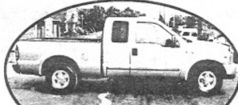
2000 Ford F250, Super Duty, Auto, AC, loaded, Low Payments

Dependable Sales & Service for all your automotive needs. ASE Certified service department