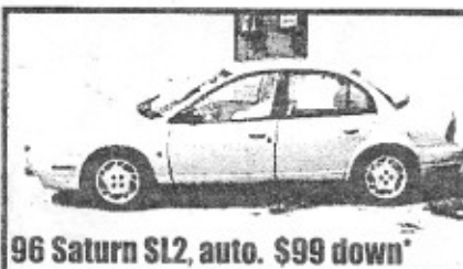
96 Saturn SL2, auto. $99 down*