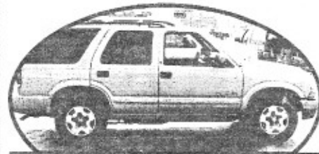
2002 Chevy Blazer, 4dr, auto, V6, 4x4 $500 Down cash or trade