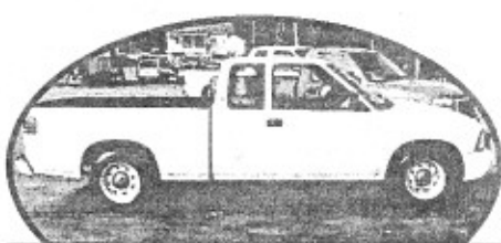
2003 GMC Sonoma, 5sp, AC $8995