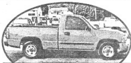
2003 Chevy 1500, auto, AC Low Payments