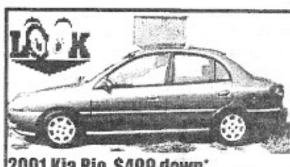
2001 Kia Rio, $499 down*