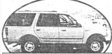
2001 Ford Expedition, 4x4, third seat, Low Miles