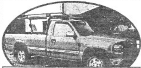
2000 Chevy Z71 1500 pickup, great work truck $8995