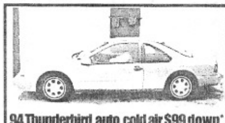
94 Thunderbird, auto, cold air $99 down*

NO CREDIT NEEDED! BAD CREDIT OK! NO TURNDOWNS! NO GIMMICKS!