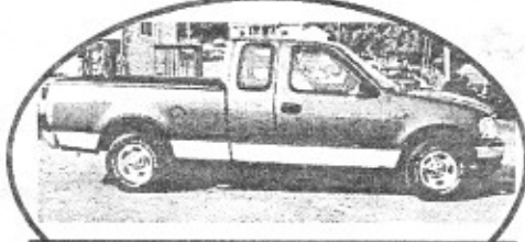
2002 Ford F150 ext. cab, auto, AC, stereo. Low Payments