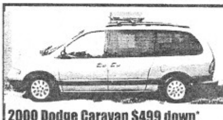
2000 Dodge Caravan $499 down*