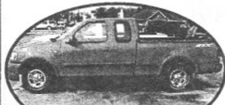
2003 Ford F150 SXT, auto, AC, PS, PB, V6 $10,995