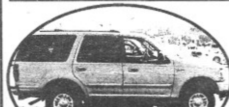
2001 Ford Expedition, 4x4, third seat, Low Miles