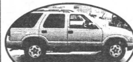
2002 Chevy Blazer, 4dr, auto, V6, 4x4 $500 Down cash or trade