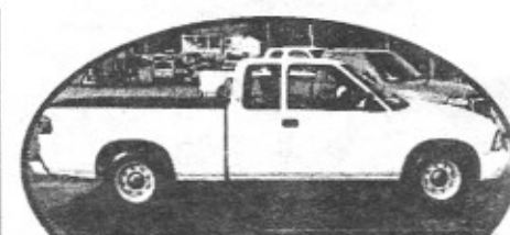
2003 GMC Sonoma, 5sp, AC $8995