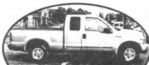
2000 Ford F250, Super Duty, Auto, AC, loaded, Low Payments