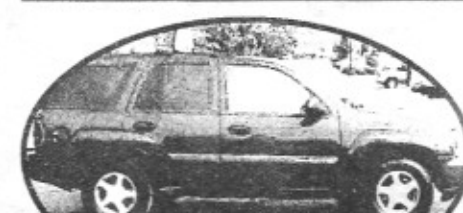
2004 Chevy Trailblazer, auto, AC, 4 door, Full Power, Low Payments!