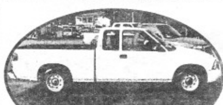
2003 GMC Sonoma, 5sp, AC $8995