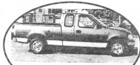
2002 Ford F150 ext. cab, auto, AC, stereo. Low Payments