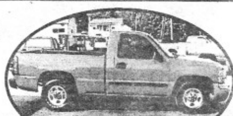
2003 Chevy 1500, auto, AC Low Payments