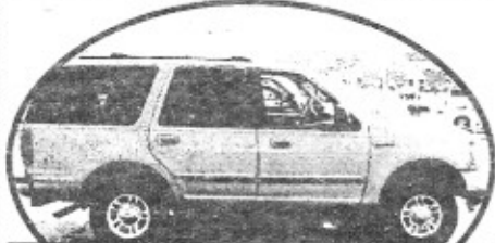
2001 Ford Expedition, 4x4, third seat, Low Miles