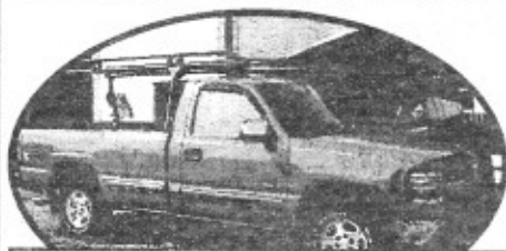
2000 Chevy Z71 1500 pickup, great work truck $8995