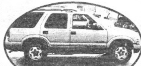
2002 Chevy Blazer, 4dr, auto, V6, 4x4 $500 Down cash or trade