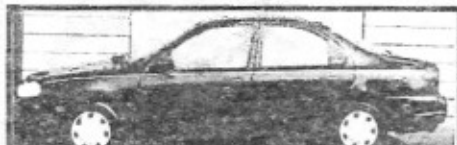
Ford Contour, maroon, auto, cold air, low miles, PW, PL, Like New!