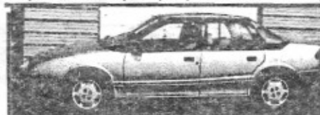
Saturn SL1, gold, 4dr, auto, cold air, Runs Great! Must Drive!