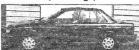
Nissan Sentra, green, 4dr, auto, cold air, Great Car! super Gas Saver!