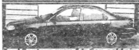
Ford Contour, gray, 4dr, 5sp, cold air, CD player, Excellent Car!