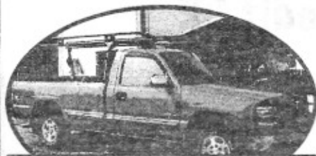
2000 Chevy Z71 1500 pickup, great work truck $8995

Dependable Sales & Service for all your automotive needs. ASE Certified service department