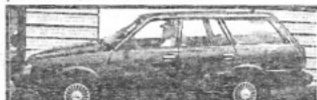
Subaru Loyol Wagon, red, 5sp, All Wheel Drive, Cold Air, One Owner!