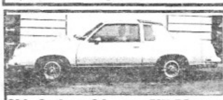
Olds Cutlass, 2dr, auto, PW, PS, Runs Great!