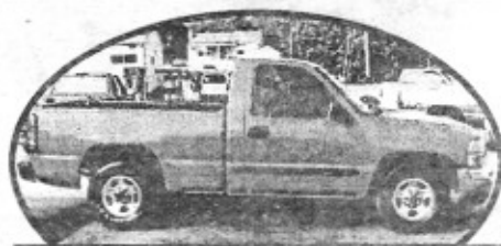
2003 Chevy 1500, auto, AC Low Payments