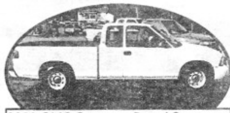
2003 GMC Sonoma, 5sp, AC $8995