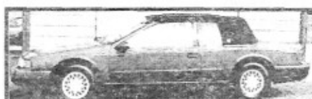
Mercury Cougar, 2dr, auto, Runs Great! Driver Needed!