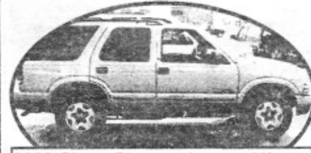
2002 Chevy Blazer, 4dr, auto, V6, 4x4 $500 Down cash or trade