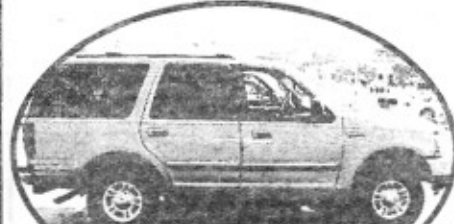
2001 Ford Expedition, 4x4, third seat, Low Miles