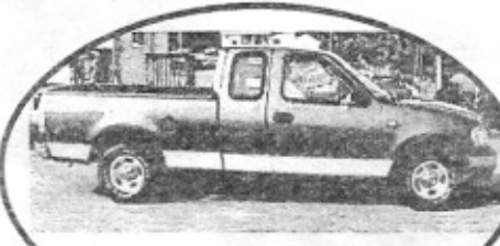
2002 Ford F150 ext. cab, auto, AC, stereo. Low Payments