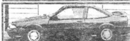
Chevy Z24, 2dr, auto, Nice Car, Runs Great

** $59 a week is on select cars. Down payments plus tax, tag, and fees on day of sale. See dealer for details.