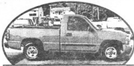
2003 Chevy 1500, auto, AC Low Payments