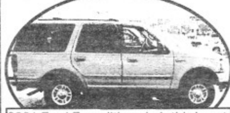
2001 Ford Expedition, 4x4, third seat, Low Miles