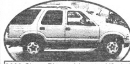
2002 Chevy Blazer, 4dr, auto, V6, 4x4 $500 Down cash or trade