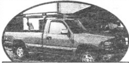
2000 Chevy Z71 1500 pickup, great work truck $8995

Dependable Sales & Service for all your automotive needs. ASE Certified service department