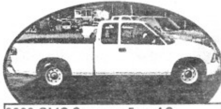
2003 GMC Sonoma, 5sp, AC $8995