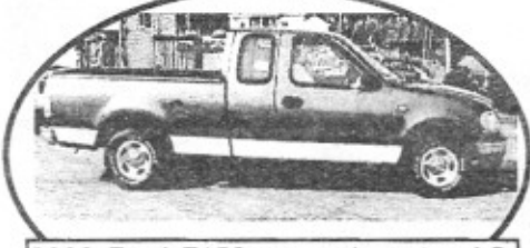
2002 Ford F150 ext. cab, auto, AC, stereo. Low Payments