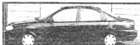
Ford Contour, maroon, auto, cold air, low miles, PW, PL, Like New!