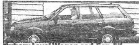
Subaru Loyal Wagon, red, 5sp, All Wheel Drive, Cold Air, One Owner!