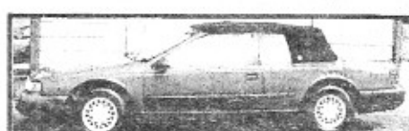
Mercury Cougar, 2dr, auto, Runs Great! Driver Needed!