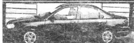
Ford Contour, gray, 4dr, 5sp, cold air, CD player, Excellent Car!