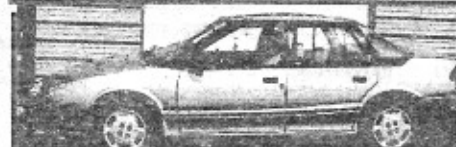
Saturn SL1, gold, 4dr, auto, cold air, Runs Great! Must Drive!