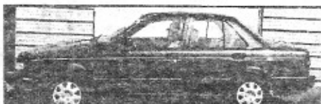
Nissan Sentra, green, 4dr, auto, cold air, Great Car! super Gas Saver!