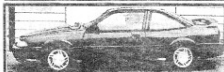
Chevy Z24, 2dr, auto, Nice Car, Runs Great

** $59 a week is on select cars. Down payments plus tax, tag, and fees on day of sale. See dealer for details.