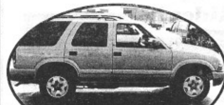
2002 Chevy Blazer, 4dr, auto, V6, 4x4 $500 Down cash or trade