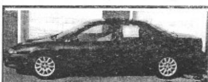
97 Dodge Intrepid, Runs Great Only $199 down*