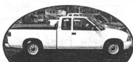
2003 GMC Sonoma, 5sp, AC $8995