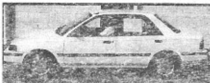
94 Mazda Protege, 5sp, Gas Saver Only $199 down*

LENOIR CITY AUTO SALES • 986-4411 • LENOIR CITY AUTO SALES • 986-4411 • LENOIR CITY AUTO SALES • 986-4411 • LENOIR CITY AUTO SALES • 986-4411 • LENOIR CITY AUTO SALES • 986-4411 • LENOIR CITY AUTO SALES • 986-4411