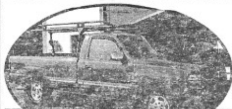
2000 Chevy Z71 1500 pickup, great work truck $8995

Dependable Sales & Service for all your automotive needs. ASE Certified service department