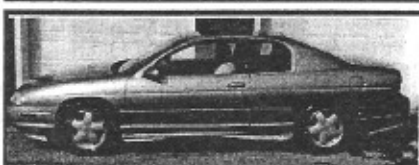
96 Monte Carlo, Ground Effects Only $299 down*

NO CREDIT NEEDED! BAD CREDIT OK! NO TURNDOWNS! NO GIMMICKS!