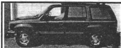
91 Explorer, 4x4, auto Only $299 down*