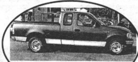
2002 Ford F150 ext. cab, auto, AC, stereo. Low Payments