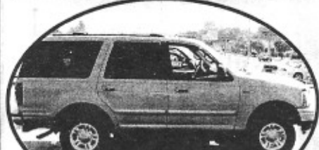
2001 Ford Expedition, 4x4, third seat, Low Miles