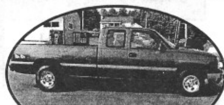
2004 Silverado, 4x4, ext. cab, V8, auto, Full Power. Sale Price $13,995