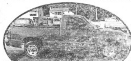
2003 Chevy 1500, auto, AC Low Payments