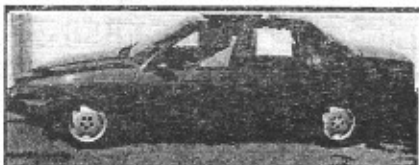
96 Chevy Corsica, auto, 4dr. Only $99 down*