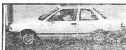
92 Nissan Sentra, Cold Air Gas Saver Only $99 down*