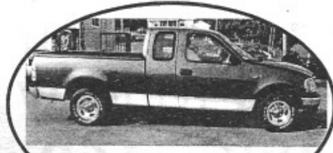
2002 Ford F150 ext. cab, auto, AC, stereo. Low Payments