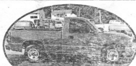
2003 Chevy 1500, auto, AC Low Payments

Dependable Sales & Service for all your automotive needs. ASE Certified service department