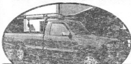
2000 Chevy Z71 1500 pickup, great work truck $3995