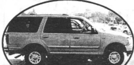
2001 Ford Expedition, 4x4, third seat, Low Miles