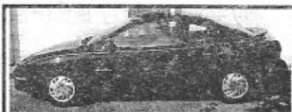
99 Pontiac Sunfire, 2dr, Great MPG, auto, 4cyl, cold air