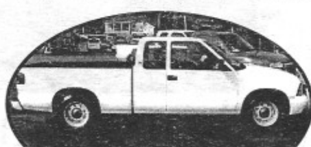
2003 GMC Sonoma, 5sp, AC $8995