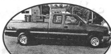
2004 Silverado, 4x4, ext. cab, V8, auto, Full Power. Sale Price $13,995