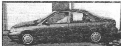
99 Mercury Mystique, Great Gas Saver, auto, 4cyl, cold air

INDEPENDENCE DAY TROOP APPRECIATION Super Sale-A-Brat from July 2nd to July 7th (closed July 4th)