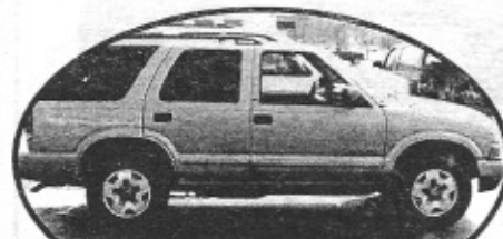
2002 Chevy Blazer, 4dr, auto, V6, 4x4 $500 Down cash or trade