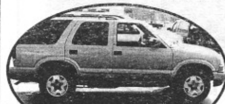
2002 Chevy Blazer, 4dr, auto, V6, 4x4 $500 Down cash or trade