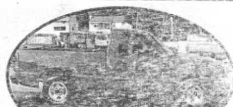
2003 Chevy 1500, auto, AC Low Payments

Dependable Sales & Service for all your automotive needs. ASE Certified service department