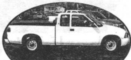
2003 GMC Sonoma, 5sp, AC $8995