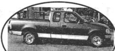
2002 Ford F150 ext. cab, auto, AC, stereo. Low Payments