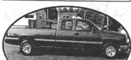
2004 Silverado, 4x4, ext. cab, V8, auto, Full Power. Sale Price $13,995