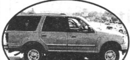
2001 Ford Expedition, 4x4, third seat, Low Miles