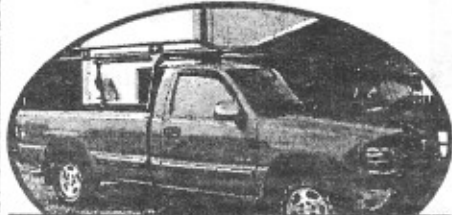
2000 Chevy Z71 1500 pickup, great work truck $8995