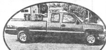
2004 Silverado, 4x4, ext. cab, V8, auto, Full Power. Sale Price $13,995