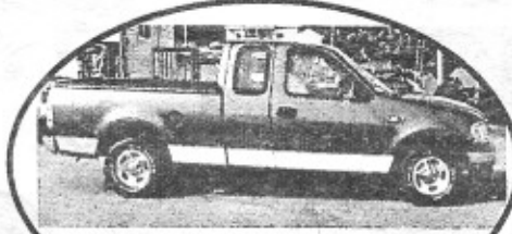
2002 Ford F150 ext. cab, auto, AC, stereo. Low Payments