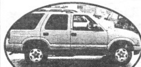
2002 Chevy Blazer, 4dr, auto, V6, 4x4 $500 Down cash or trade