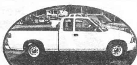
2003 GMC Sonoma, 5sp, AC $8995