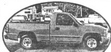
2003 Chevy 1500, auto, AC Low Payments