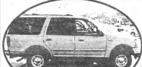
2001 Ford Expedition, 4x4, third seat, Low Miles