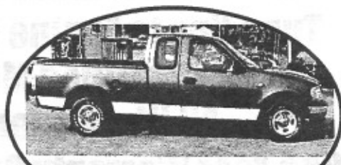
2002 Ford F150 ext. cab, auto, AC, stereo. Low Payments