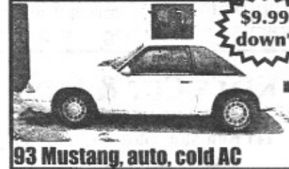
93 Mustang, auto, cold AC