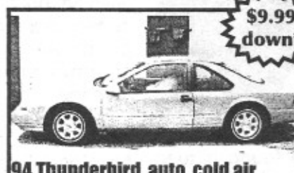
94 Thunderbird, auto, cold air