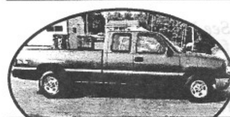
2004 Silverado, 4x4, ext. cab, V8, auto, Full Power. Sale Price $13,995