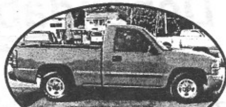
2003 Chevy 1500, auto, AC Low Payments