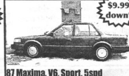
87 Maxima, V6, Sport, 5spd