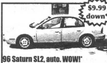
96 Saturn SL2, auto. WOW!

LENOIR CITY AUTO SALES • 986-4411 • LENOIR CITY AUTO SALES • 986-4411 • LENOIR CITY AUTO SALES • 986-4411 • LENOIR CITY AUTO SALES • 986-4411 • LENOIR CITY AUTO SALES • 986-4411 • LENOIR CITY AUTO SALES • 986-4411