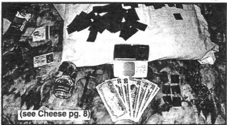
(see Cheese pg. 8)

Evidence seized in the drug bust by Narcotics LCSD