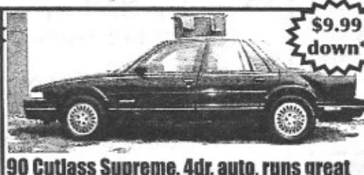
90 Cutlass Supreme, 4dr, auto, runs great

Lenoir City AUTO SALES $9.99* DOWN* Get One Before They Are Gone