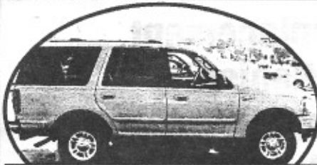
2001 Ford Expedition, 4x4, third seat, Low Miles