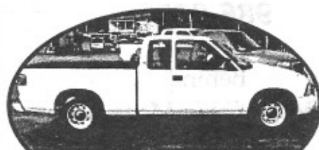
2003 GMC Sonoma, 5sp, AC $8995