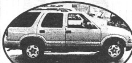
2002 Chevy Blazer, 4dr, auto, V6, 4x4 $500 Down cash or trade