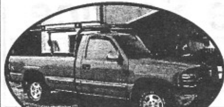
2000 Chevy Z71 1500 pickup, great work truck $8995

Dependable Sales & Service for all your automotive needs. ASE Certified service department