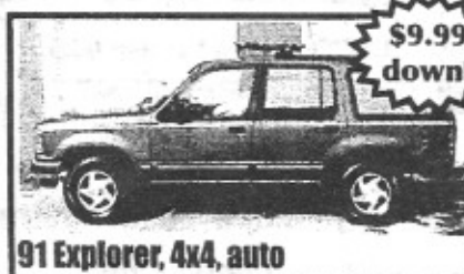
91 Explorer, 4x4, auto