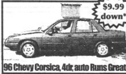
96 Chevy Corsica, 4dr, auto Runs Great