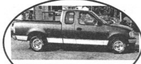
2002 Ford F150 ext. cab, auto, AC, stereo. Low Payments