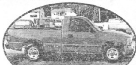
2003 Chevy 1500, auto, AC Low Payments