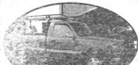
2000 Chevy Z71 1500 pickup, great work truck $8995