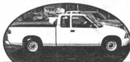
2003 GMC Sonoma, 5sp, AC $8995