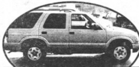
2002 Chevy Blazer, 4dr, auto, V6, 4x4 $500 Down cash or trade