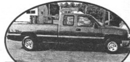
2004 Silverado, 4x4, ext. cab, V8, auto, Full Power. Sale Price $13,995