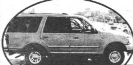
2001 Ford Expedition, 4x4, third seat, Low Miles