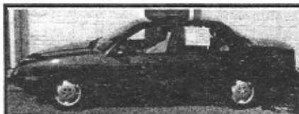
96 Chevy Corsica, V6, Auto $300 Drives Off*