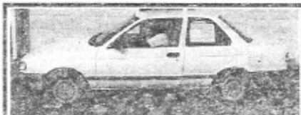
92 Nissan Sentra, Gas Saver, 5sp. $300 Drives Off*

LENOIR CITY AUTO SALES • 986-4411 • LENOIR CITY AUTO SALES • 986-4411 • LENOIR CITY AUTO SALES • 986-4411 • LENOIR CITY AUTO SALES • 986-4411 • LENOIR CITY AUTO SALES • 986-4411