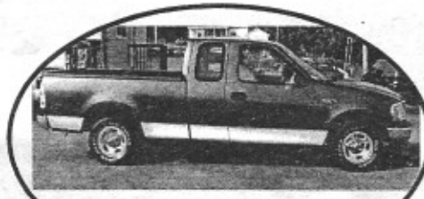
2002 Ford F150 ext. cab, auto, AC, stereo. Low Payments