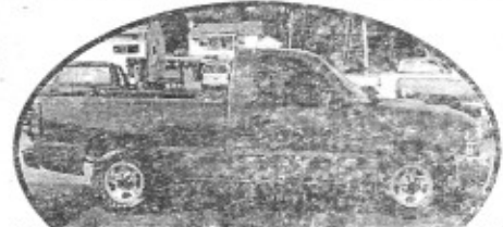
2003 Chevy 1500, auto, AC Low Payments