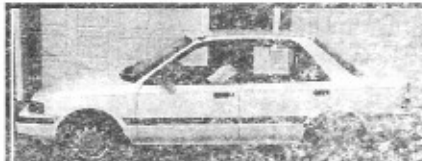
92 Mazda Protege, 5sp. Gas Saver $400 Drives Off*