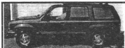
91 Ford Explorer, 4x4, auto $50/week*

NO CREDIT NEEDED! BAD CREDIT OK! NO TURNDOWNS! NO GIMMICKS!