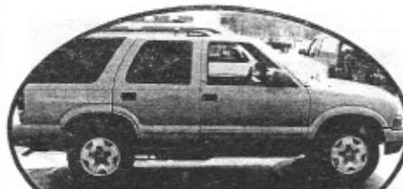
2002 Chevy Blazer, 4dr, auto, V6, 4x4 $500 Down cash or trade