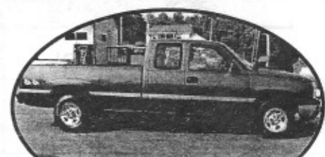
2004 Silverado, 4x4, ext. cab, V8, auto, Full Power. Sale Price $13,995