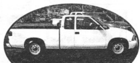
2003 GMC Sonoma, 5sp, AC $8995