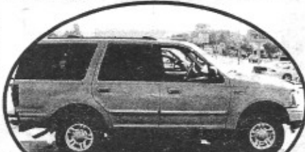
2001 Ford Expedition, 4x4, third seat, Low Miles