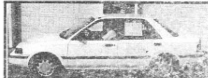
92 Mazda Protege, 5sp, Gas Saver $400 Drives Off*