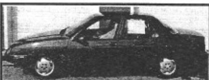
96 Chevy Corsica, V6, Auto $300 Drives Off*

IT'S TRUE DOWN PAYMENTS AS LOW AS $300 AND DRIVE OFF*