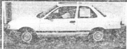
92 Nissan Sentra, Gas Saver, 5sp. $300 Drives Off*

LENOIR CITY AUTO SALES • 986-4411 • LENOIR CITY AUTO SALES • 986-4411 • LENOIR CITY AUTO SALES • 986-4411 • LENOIR CITY AUTO SALES • 986-4411 • LENOIR CITY AUTO SALES • 986-4411 • LENOIR CITY AUTO SALES • 986-4411