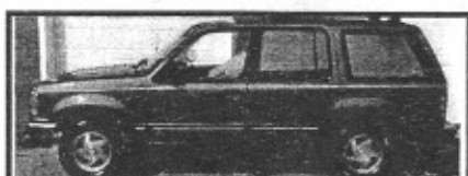
91 Ford Explorer, 4x4, auto $50/week*

No CREDIT NEEDED! BAD CREDIT OK! No TURNDOWNS! No GIMMICKS!