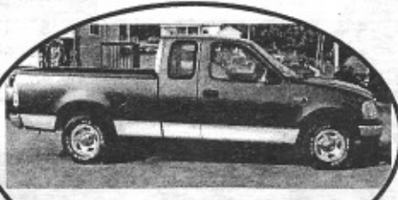
2002 Ford F150 ext. cab, auto, AC, stereo. Low Payments