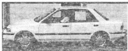
94 Mazda Protege, 5sp, Gas Saver Only $199 down*

LENOIR CITY AUTO SALES • 986-4411 • LENOIR CITY AUTO SALES • 986-4411 • LENOIR CITY AUTO SALES • 986-4411 • LENOIR CITY AUTO SALES • 986-4411 • LENOIR CITY AUTO SALES • 986-4411 • LENOIR CITY AUTO SALES • 986-4411