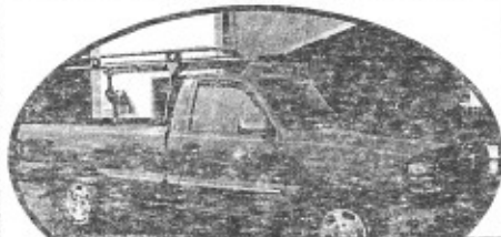
2000 Chevy Z71 1500 pickup, great work truck $8995

Dependable Sales & Service for all your automotive needs. ASE Certified service department