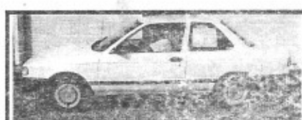
92 Nissan Sentra, Cold Air Gas Saver Only $99 down*