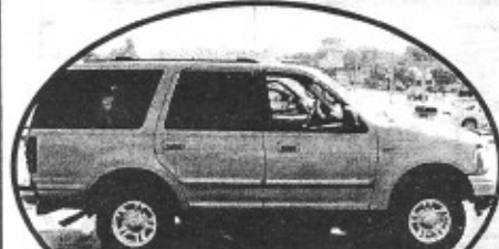
2001 Ford Expedition, 4x4, third seat, Low Miles