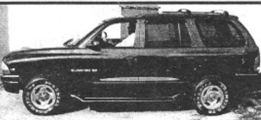
99 Durango, 4x4, loaded $8150 blue book value ONLY $5777 CASH