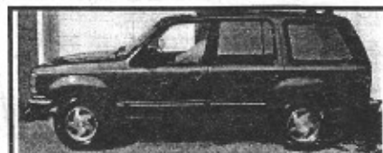
91 Explorer, 4x4, auto Only $299 down*