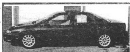
97 Dodge Intrepid, Runs Great Only $199 down*