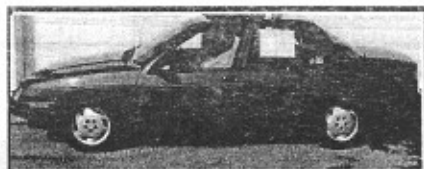
96 Chevy Corsica, auto, 4dr. Only $99 down*