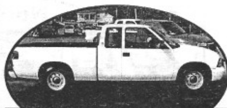
2003 GMC Sonoma, 5sp, AC $8995