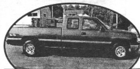
2004 Silverado, 4x4, ext. cab, V8, auto, Full Power. Sale Price $13,995