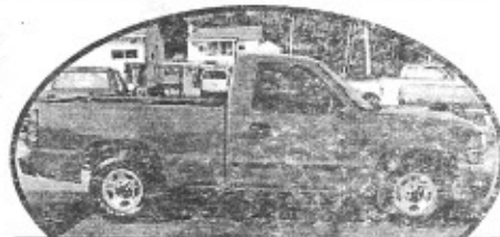
2003 Chevy 1500, auto, AC Low Payments