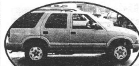
2002 Chevy Blazer, 4dr, auto, V6, 4x4 $500 Down cash or trade