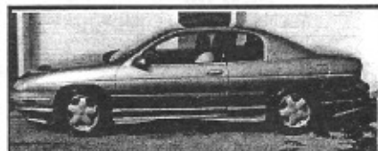
96 Monte Carlo, Ground Effects Only $299 down*

NO CREDIT NEEDED! BAD CREDIT OK! NO TURNDOWNS! NO GIMMICKS!