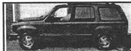
91 Explorer, 4x4, auto Only $299 down*