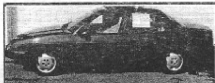
96 Chevy Corsica, auto, 4dr. Only $99 down*