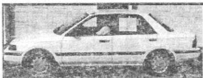
94 Mazda Protege, 5sp, Gas Saver Only $199 down*

LENOIR CITY AUTO SALES • 986-4411 • LENOIR CITY AUTO SALES • 986-4411 • LENOIR CITY AUTO SALES • 986-4411 • LENOIR CITY AUTO SALES • 986-4411 • LENOIR CITY AUTO SALES • 986-4411 • LENOIR CITY AUTO SALES • 986-4411