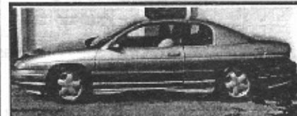
96 Monte Carlo, Ground Effects Only $299 down*

NO CREDIT NEEDED! BAD CREDIT OK! NO TURNDOWNS! NO GIMMICKS!