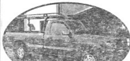
2000 Chevy Z71 1500 pickup, great work truck $8995

Dependable Sales & Service for all your automotive needs. ASE Certified service department