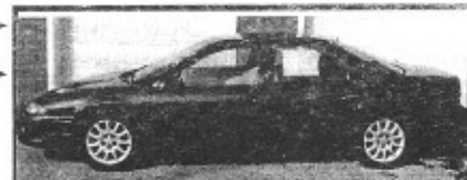
97 Dodge Intrepid, Runs Great Only $199 down*