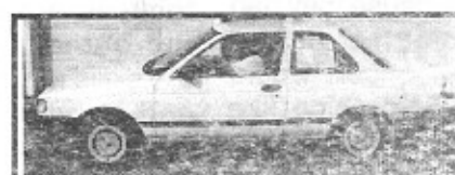
92 Nissan Sentra, Cold Air Gas Saver Only $99 down*