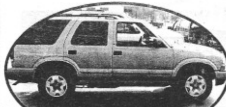
2002 Chevy Blazer, 4dr, auto, V6, 4x4 $500 Down cash or trade