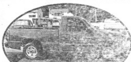
2003 Chevy 1500, auto, AC Low Payments