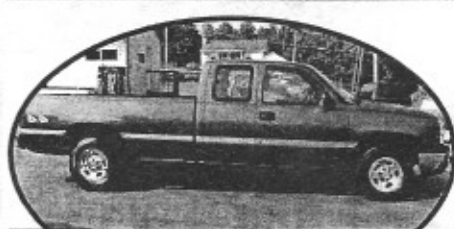
2004 Silverado, 4x4, ext. cab, V8, auto, Full Power. Sale Price $13,995