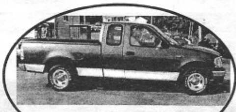
2002 Ford F150 ext. cab, auto, AC, stereo. Low Payments