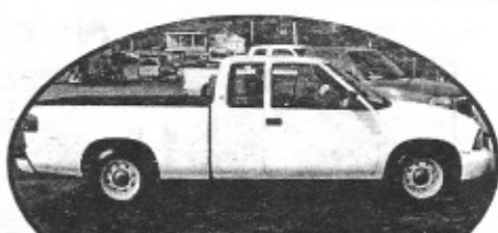
2003 GMC Sonoma, 5sp, AC $8995