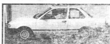
92 Nissan Sentra, Cold Air Gas Saver Only $99 down*