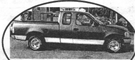
2002 Ford F150 ext. cab, auto, AC, stereo. Low Payments