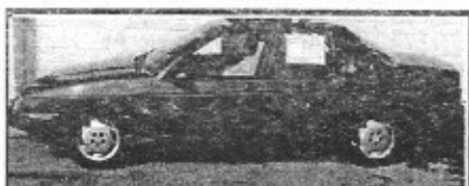
96 Chevy Corsica, auto, 4dr. Only $99 down*