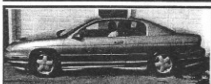
96 Monte Carlo, Ground Effects Only $299 down*

NO CREDIT NEEDED! BAD CREDIT OK! NO TURNDOWNS! NO GIMMICKS!