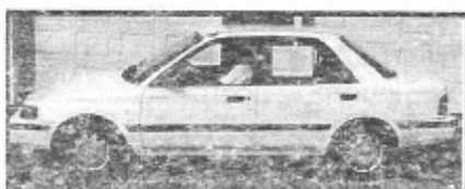
94 Mazda Protege, 5sp, Gas Saver Only $199 down*

LENOIR CITY AUTO SALES • 986-4411 • LENOIR CITY AUTO SALES • 986-4411 • LENOIR CITY AUTO SALES • 986-4411 • LENOIR CITY AUTO SALES • 986-4411 • LENOIR CITY AUTO SALES • 986-4411