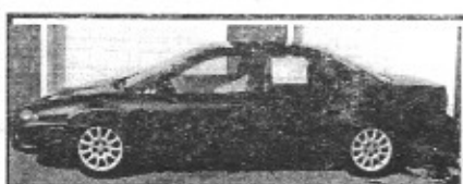
97 Dodge Intrepid, Runs Great Only $199 down*