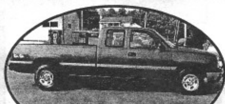
2004 Silverado, 4x4, ext. cab, V8, auto, Full Power. Sale Price $13,995