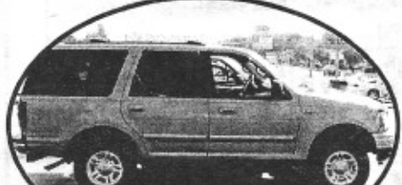
2001 Ford Expedition, 4x4, third seat, Low Miles