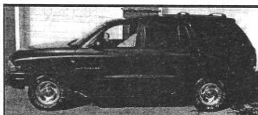
99 Durango, 4x4, loaded $8150 blue book value ONLY $5777 CASH