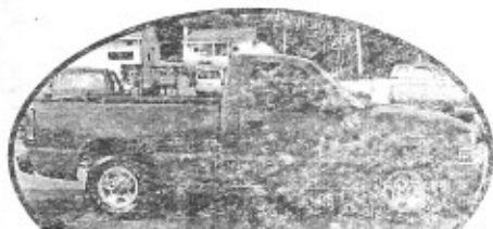
2003 Chevy 1500, auto, AC Low Payments

Dependable Sales & Service for all your automotive needs. ASE Certified service department