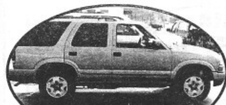
2002 Chevy Blazer, 4dr, auto, V6, 4x4 $500 Down cash or trade