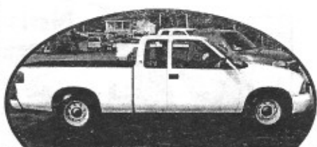
2003 GMC Sonoma, 5sp, AC $8995