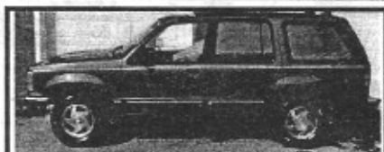
91 Explorer, 4x4, auto Only $299 down*