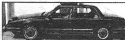
89 Bonneville, V6, Family Size Auto Only $877 Cash*