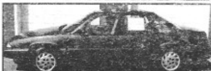
94 Grand Prix, 4dr. Family Car, Cold AC $500 Delivers*

Look at this weeks Buy Here Pay Here Specials! These deals won't last long! Any vehicle above $500 Drive off with low weekly payments