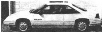
92 Grand Prix, Sporty, Auto, Runs Great Only $877 Cash*

NO CREDIT NEEDED! BAD CREDIT OK! NO TURNDOWNS! NO GIMMICKS! *Some restrictions apply. All down payments plus TAX, TAG and FEES. With Approved Down Payment. See Dealer for Details.