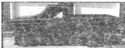
88 Ford F150, auto, V8, cold AC $500 Delivers*