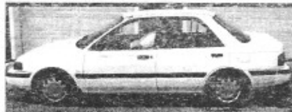
92 Mazda Protege, 5sp. great mpg Only $500 Delivers*