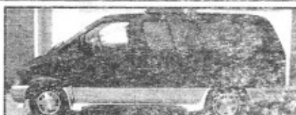
94 Ford Aerostar, 7 pass. Cold AC Only $500 Delivers*