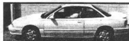
92 Olds Achieva, Runs Great Only $877 Cash*

HURRY! HURRY! HURRY! HURRY! HURRY! HURRY! HURRY! HURRY! HURRY! These Cash Specials Will Be Gone Soon! Any Car Below ONLY $877 Cash