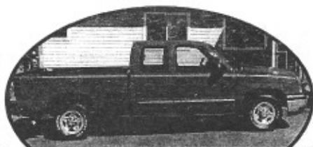
2004 Chevy Ext. Cab, auto, V8, AC, quad doors, low payments