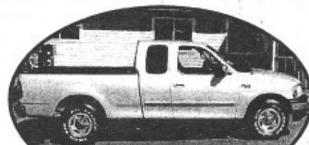
2001 Ford Ext. Cab, low miles, low payments, low down payment