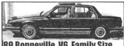
89 Bonneville, V6, Family Size Auto Only *$877 Cash*