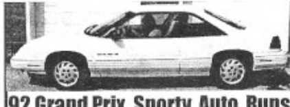
92 Grand Prix, Sporty, Auto, Runs Great Only *$877 Cash*

NO CREDIT NEEDED! BAD CREDIT OK! NO TURNDOWNS! NO GIMMICKS! *Some restrictions apply. All down payments plus TAX, TAG and FEES . With Approved Down Payment. See Dealer for Details.