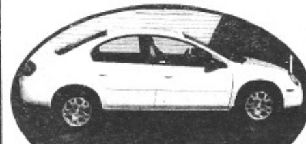
2005 Dodge Neon, 4dr, auto, AC, low miles $8995