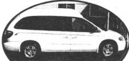
2003 Dodge Conversion Van, Low Miles, Fully Loaded. $13,995