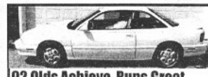
92 Olds Achieva, Runs Great Only $877 Cash

HURRY! HURRY! HURRY! HURRY! HURRY! HURRY! HURRY! HURRY! HURRY! These Cash Specials Will Be Gone Soon! Any Car Below ONLY $877 Cash