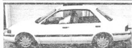
92 Mazda Protege, 5sp. great mpg. Only $500 Delivery*