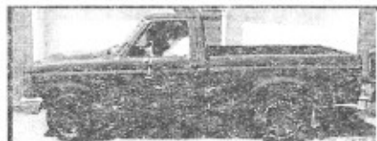
88 Ford F150, auto, V8, cold AC $500 Delivers*