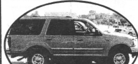
2001 Ford Expedition, 4x4, third seat, Low Miles