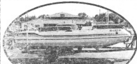
Viking Deck Boat, Great Shape $3200