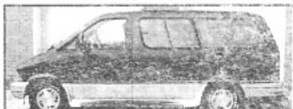
94 Ford Aerostar, 7 pass. Cold AC Only *$500 Delivers*