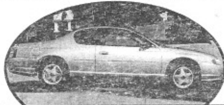
2003 Chevy Monte Carlo, Low Miles, Low Payments