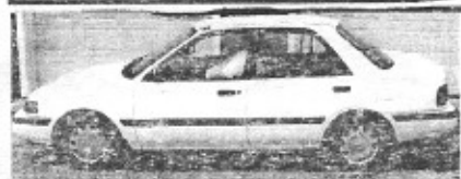
92 Mazda Protege, 5sp. great mpg. Only $500 Delivers*