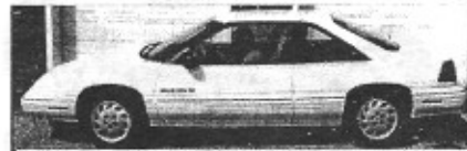
92 Grand Prix, Sporty, Auto, Runs Great Only $877 Cash

NO CREDIT NEEDED! BAD CREDIT OK! NO TURNDOWNS! NO GIMMICKS!