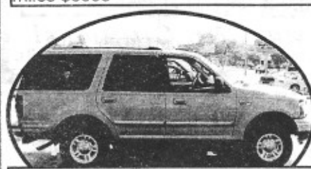
2001 Ford Expedition, 4x4, third seat, Low Miles