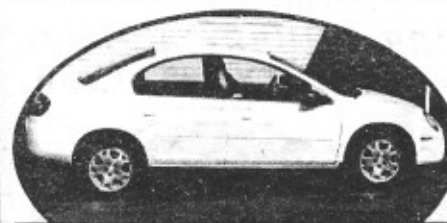
2005 Dodge Neon, 4dr, auto, AC, low miles $8995

Dependable Sales & Service for all your automotive needs. ASE Certified service department