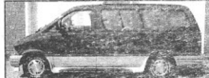
94 Ford Aerostar, 7 pass. Cold AC Only $500 Delivers*