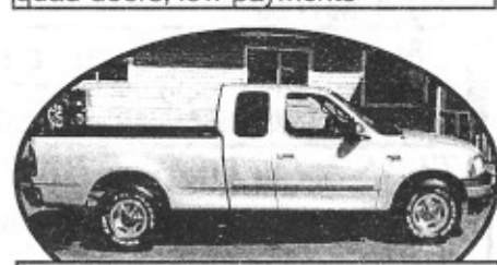
2001 Ford Ext. Cab, low miles, low payments, low down payment