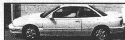
92 Olds Achieva, Runs Great Only $877 Cash

Look at this weeks Buy Here Pay Here Specials! These deals won't last long! Any vehicle above $500 Drive off with low weekly payments HURRY! HURRY! HURRY! HURRY! HURRY! HURRY! HURRY! HURRY! HURRY! These Cash Specials Will Be Gone Soon! Any Car Below ONLY $877 Cash