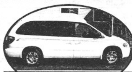
2003 Dodge Conversion Van, Low Miles, Fully Loaded. $13,995