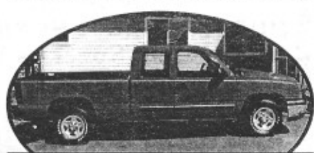
2004 Chevy Ext. Cab, auto, V8, AC, quad doors, low payments