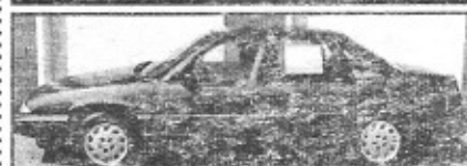
94 Grand Prix, 4dr. Family Car, Cold AC $500 Delivers*

Look at this weeks Buy Here Pay Here Specials! These deals won't last long! Any vehicle above $500 Drive off with low weekly payments HURRY! HURRY! HURRY! HURRY! HURRY! HURRY! HURRY! HURRY! HURRY! These Cash Specials Will Be Gone Soon! Any Car Below ONLY $877 Cash