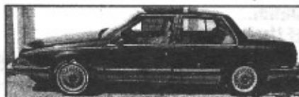
89 Bonneville, V6, Family Size Auto Only $877 Cash