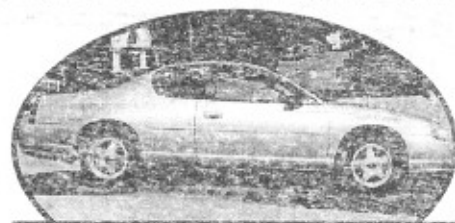
2003 Chevy Monte Carlo, Low Miles, Low Payments