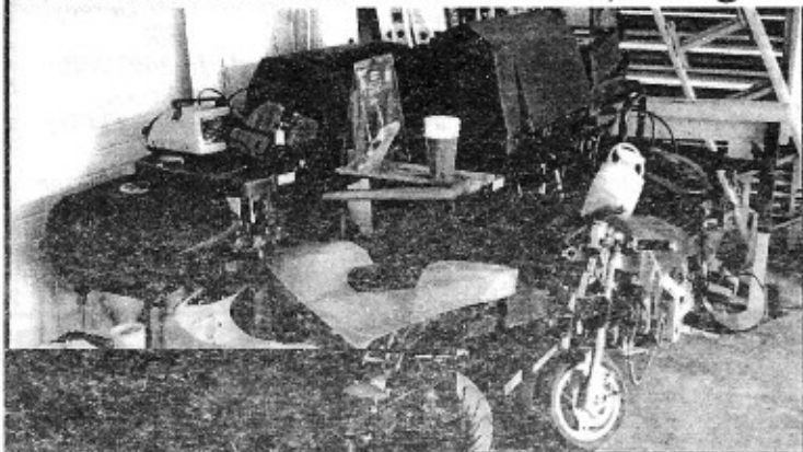
photo above: some of the stolen items have not been claimed. Call LCSD CID with information left: an ATV and Razor cycle that were recovered and had been stolen from a Lenoir City man (see Graves pg. 6)

LCSD CID recovers stolen items; charge 1