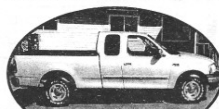
2001 Ford Ext. Cab, low miles, low payments, low down payment