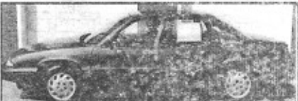
94 Grand Prix, 4dr. Family Car, Cold AC $500 Delivers*

Look at this weeks Buy Here Pay Here Specials! These deals won't last long! Any vehicle above $500 Drive off with low weekly payments