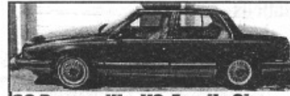
89 Bonneville, V6, Family Size Auto Only $877 Cash