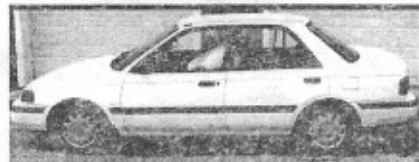
92 Mazda Protege, 5sp. great mpg Only $500 Delivers*