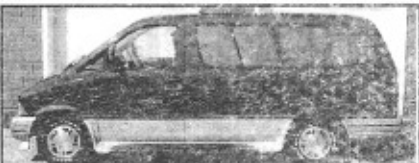
94 Ford Aerostar, 7 pass. Cold AC Only $500 Delivers*