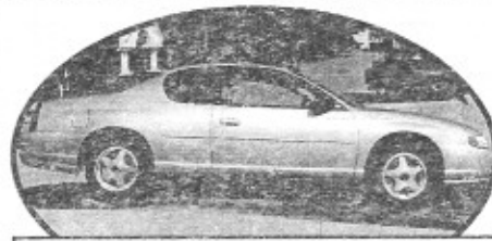
2003 Chevy Monte Carlo, Low Miles, Low Payments