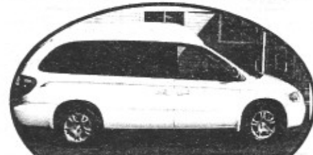
2003 Dodge Conversion Van, Low Miles, Fully Loaded. $13,995