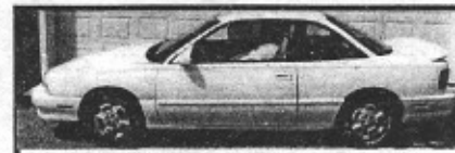
92 Olds Achieva, Runs Great Only $877 Cash

HURRY! HURRY! HURRY! HURRY! HURRY! HURRY! HURRY! HURRY! These Cash Specials Will Be Gone Soon! Any Car Below ONLY $877 Cash