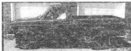
88 Ford F150, auto, V8, cold AC $500 Delivers*

LENOIR CITY AUTO SALES • 986-4411 • LENOIR CITY AUTO SALES • 986-4411 • LENOIR CITY AUTO SALES • 986-4411 • LENOIR CITY AUTO SALES • 986-4411 • LENOIR CITY AUTO SALES • 986-4411