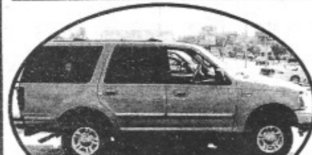
2001 Ford Expedition, 4x4, third seat, Low Miles