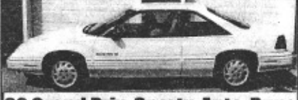
92 Grand Prix, Sporty, Auto, Runs Great Only $877 Cash

NO CREDIT NEEDED! BAD CREDIT OK! NO TURNDOWNS! NO GIMMICKS! *Some restrictions apply. All down payments plus TAX, TAG and FEES. With Approved Down Payment. See Dealer for Details.