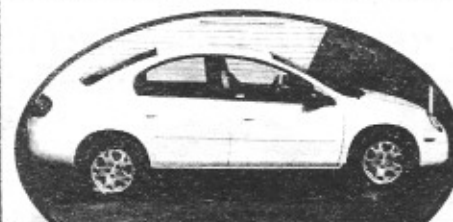
2005 Dodge Neon, 4dr, auto, AC, low miles $8995