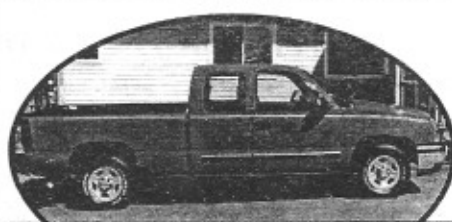
2004 Chevy Ext. Cab, auto, V8, AC, quad doors, low payments