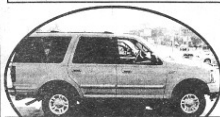
2001 Ford Expedition, 4x4, third seat, Low Miles