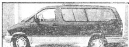
94 Ford Aerostar, 7 pass. Cold AC Only $500 Delivers*