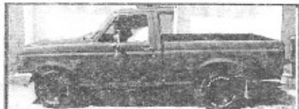
88 Ford F150, auto, V8, cold AC $500 Delivers*

Must Sell 30 Cars by 6-30-07 We are DEALING like never before!