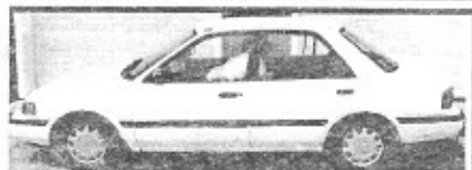
92 Mazda Protege, 5sp. great mpg Only $500 Delivers*