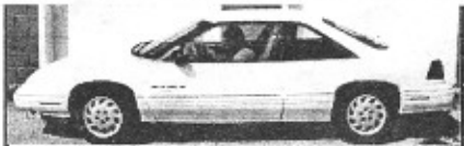
92 Grand Prix, Sporty, Auto, Runs Great Only $877 Cash*

NO CREDIT NEEDED! BAD CREDIT OK! NO TURNDOWNS! NO GIMMICKS! *Some restrictions apply. All down payments plus TAX, TAG and FEES. With Approved Down Payment. See Dealer for Details.