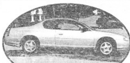
2003 Chevy Monte Carlo, Low Miles, Low Payments