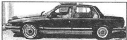
89 Bonneville, V6, Family Size Auto Only $877 Cash*