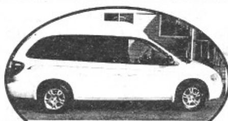
2003 Dodge Conversion Van, Low Miles, Fully Loaded. $13,995