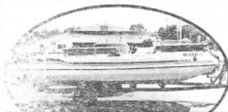
Viking Deck Boat, Great Shape