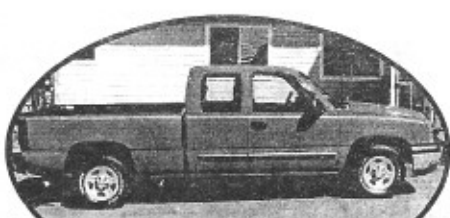
2004 Chevy Ext. Cab, auto, V8, AC, quad doors, low payments