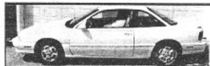
92 Olds Achieva, Runs Great Only $877 Cash*

Look at this weeks Buy Here Pay Here Specials! These deals won't last long! Any vehicle above $500 Drive off with low weekly payments HURRY! HURRY! HURRY! HURRY! HURRY! HURRY! HURRY! HURRY! HURRY! These Cash Specials Will Be Gone Soon! Any Car Below ONLY $877 Cash