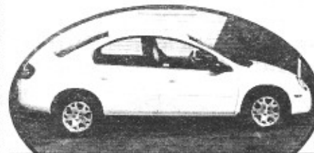
2005 Dodge Neon, 4dr, auto, AC, low miles $8995

Dependable Sales & Service for all your automotive needs. ASE Certified service department