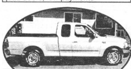
2001 Ford Ext. Cab, low miles, low payments, low down payment