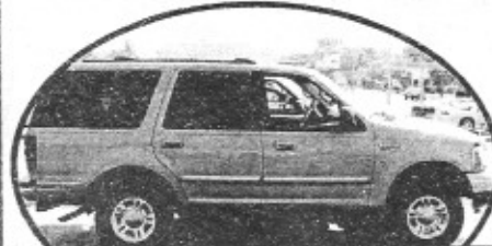
2001 Ford Expedition, 4x4, third seat, Low Miles