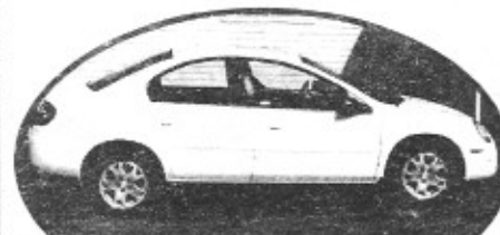
2005 Dodge Neon, 4dr, auto, AC, low miles $8995