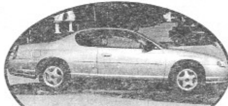
2003 Chevy Monte Carlo, Low Miles, Low Payments