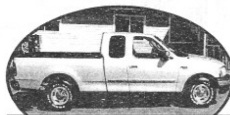
2001 Ford Ext. Cab, low miles, low payments, low down payment