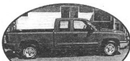
2004 Chevy Ext. Cab, auto, V8, AC, quad doors, low payments