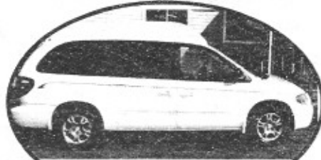
2003 Dodge Conversion Van, Low Miles, Fully Loaded. $13,995