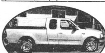
2001 Ford Ext. Cab, low miles, low payments, low down payment