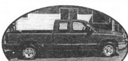
2004 Chevy Ext. Cab, auto, V8, AC, quad doors, low payments