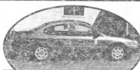
2004 Ford Taurus LX, AT, AC, Low Payments, Sale Price $6995