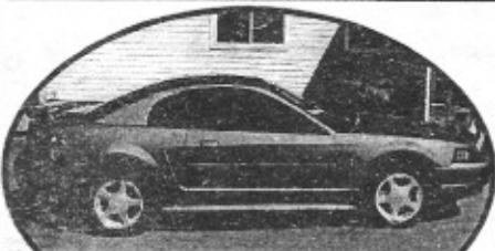
2002 Ford Mustang, Auto, AC, clean, Low down, low payments