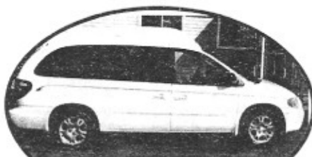
2003 Dodge Conversion Van, Low Miles, Fully Loaded. $13,995