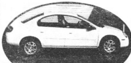
2005 Dodge Neon, 4dr, auto, AC, low miles $8995