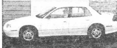
Grand Am, Auto, PW, PL, tilt, cruise, Ex. Clean ONLY $99 down*