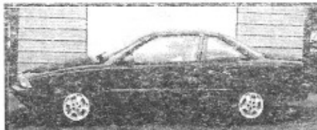
Achieva, auto, Cold Air, FM/Cass, Good Car only $0 down*