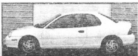
Neon, auto, AC, all factory equip. only $99 down*