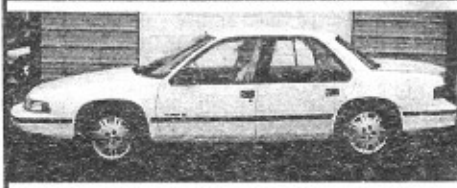
Lumina, auto, AC, FM, PW, PL, Tilt, Runs Great only $0 Down*