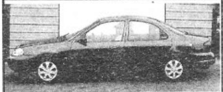
Contour, auto, AC, All Power Equipment $0 Down*