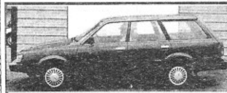
Subaru, one owner, 4wd, Ex. Clean $99 down*