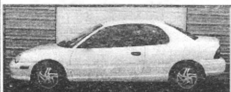
Neon, auto, AC, all factory equip. only $99 down*