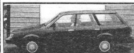
Subaru, one owner, 4wd, Ex. Clean $99 down*