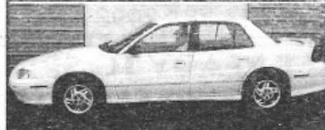
Grand Am, Auto, PW, PL, tilt, cruise, Ex. Clean ONLY $99 down*