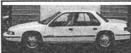
Lumina, auto, AC, FM, PW, PL, Tilt, Runs Great only $0 Down*