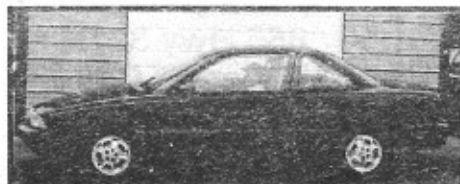
Achieva, auto, Cold Air, FM/Cass, Good Car only $0 down*