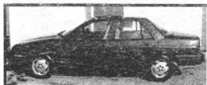
97 Aspire, great gas mileage Only $177 Down