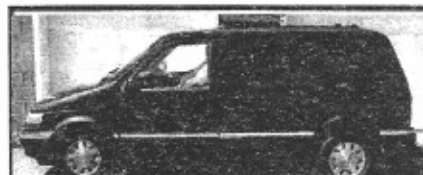
92 Dodge Caravan, Ready for Summer $66 Down