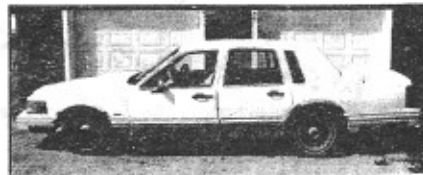
91 Lincoln Town Car, Luxury, Cold AC Only $29 Down

NO CREDIT NEEDED! BAD CREDIT OK! NO TURNDOWNS! NO GIMMICKS!