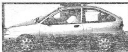
96 Corsica, runs great, auto Only $55 Down

LENOIR CITY AUTO SALES • 986-4411 • LENOIR CITY AUTO SALES • 986-4411 • LENOIR CITY AUTO SALES • 986-4411 • LENOIR CITY AUTO SALES • 986-4411 • LENOIR CITY AUTO SALES • 986-4411