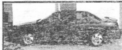
99 Grand Prix, runs great, Cold AC Only $177 Down

Let us show you just How Easy it can be come by Today!!!