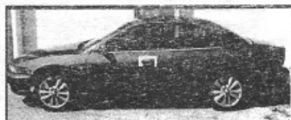
99 Mitsubishi Galant, Very Nice Only $499 Down