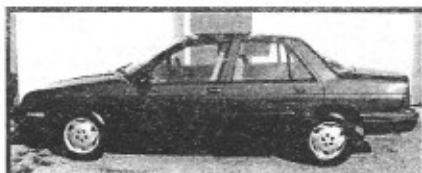
97 Aspire, great gas mileage Only $177 Down*