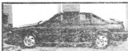
99 Grand Prix, runs great, Cold AC Only $177 Down*

Let us show you just How Easy it can be come by Today!!!