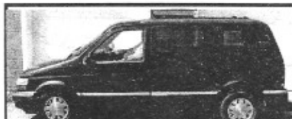
92 Dodge Caravan, Ready for Summer $66 Down*