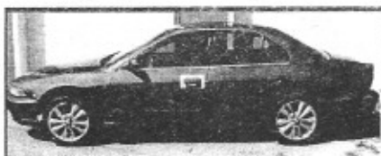
99 Mitsubishi Galant, Very Nice Only $499 Down*