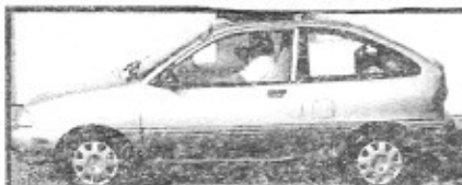
96 Corsica, runs great, auto Only $55 Down*

LENOIR CITY AUTO SALES • 986-4411 • LENOIR CITY AUTO SALES • 986-4411 • LENOIR CITY AUTO SALES • 986-4411 • LENOIR CITY AUTO SALES • 986-4411 • LENOIR CITY AUTO SALES • 986-4411 • LENOIR CITY AUTO SALES • 986-4411