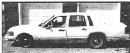
91 Lincoln Town Car, Luxury, Cold AC Only $29 Down*

NO CREDIT NEEDED! BAD CREDIT OK! NO TURNDOWNS! NO GIMMICKS!