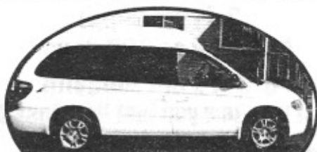
2003 Dodge Conversion Van, Low Miles, Fully Loaded. $13,995