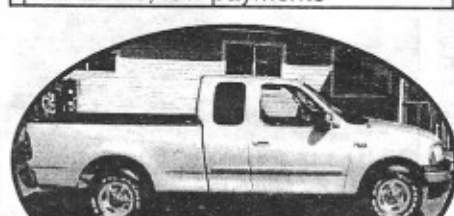
2001 Ford Ext. Cab, low miles, low payments, low down payment