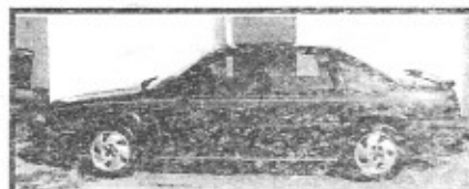
99 Grand Prix, runs great, Cold AC Only *$177 Down*

Let us show you just How Easy it can be come by Today!!!