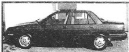
97 Aspire, great gas mileage Only *$177 Down*