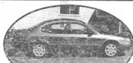
2004 Ford Taurus LX, AT, AC, Low Payments, Sale Price $6995