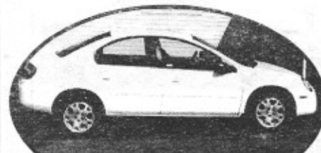
2005 Dodge Neon, 4dr, auto, AC, low miles $8995