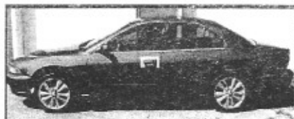
99 Mitsubishi Galant, Very Nice Only *$499 Down*