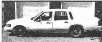
91 Lincoln Town Car, Luxury, Cold AC Only *$29 Down*

NO CREDIT NEEDED! BAD CREDIT OK! NO TURNDOWNS! NO GIMMICKS!