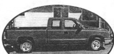
2004 Chevy Ext. Cab, auto, V8, AC, quad doors, low payments