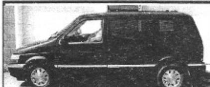
92 Dodge Caravan, Ready for Summer *$66 Down*