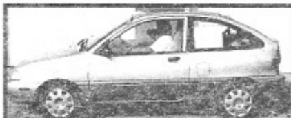
96 Corsica, runs great, auto Only *$55 Down*

LENOIR CITY AUTO SALES • 986-4411 • LENOIR CITY AUTO SALES • 986-4411 • LENOIR CITY AUTO SALES • 986-4411 • LENOIR CITY AUTO SALES • 986-4411 • LENOIR CITY AUTO SALES • 986-4411