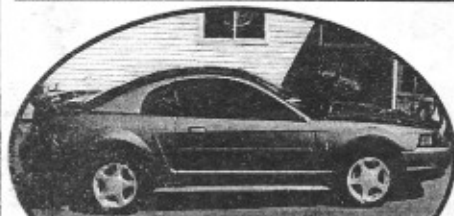
2002 Ford Mustang, Auto, AC, clean, Low down, low payments