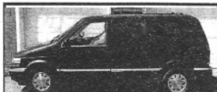
92 Dodge Caravan, Ready for Summer *$66 Down*