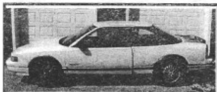
90 Olds Cutlass, 2dr, auto, runs great Only *$29 Down*