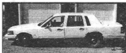
91 Lincoln Town Car, Luxury, Cold AC Only *$29 Down*

NO CREDIT NEEDED! BAD CREDIT OK! NO TURNDOWNS! NO GIMMICKS!