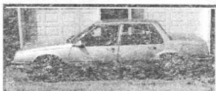
91 Buick Lesabre, Runs Great Only *$29 Down*

LENOIR CITY AUTO SALES • 986-4411 • LENOIR CITY AUTO SALES • 986-4411 • LENOIR CITY AUTO SALES • 986-4411 • LENOIR CITY AUTO SALES • 986-4411 • LENOIR CITY AUTO SALES • 986-4411 • LENOIR CITY AUTO SALES • 986-4411