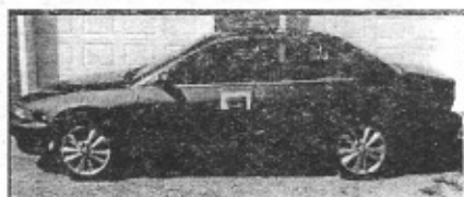
99 Mitsubishi Galant, Very Nice Only *$499 Down*