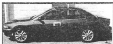
99 Mitsubishi Galant, Very Nice Only $499 Down*