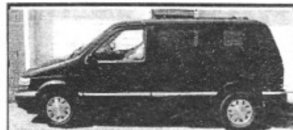
92 Dodge Caravan, Ready for Summer $66 Down*