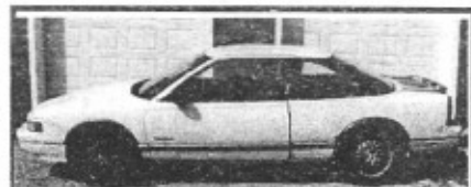
90 Olds Cutlass, 2dr, auto, runs great Only $29 Down*