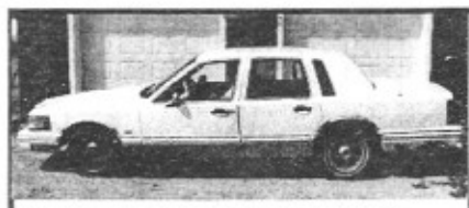
91 Lincoln Town Car, Luxury, Cold AC Only $29 Down*

NO CREDIT NEEDED! BAD CREDIT OK! NO TURNDOWNS! NO GIMMICKS!