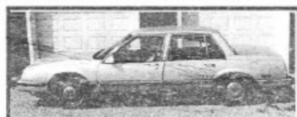
91 Buick Lesabre, Runs Great Only $29 Down*

LENOIR CITY AUTO SALES • 986-4411 • LENOIR CITY AUTO SALES • 986-4411 • LENOIR CITY AUTO SALES • 986-4411 • LENOIR CITY AUTO SALES • 986-4411 • LENOIR CITY AUTO SALES • 986-4411 • LENOIR CITY AUTO SALES • 986-4411