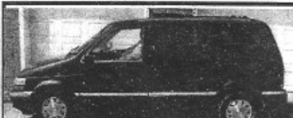
92 Dodge Caravan, Ready for Summer $66 Down*