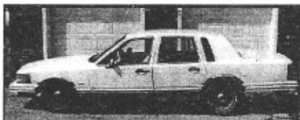
91 Lincoln Town Car, Luxury, Cold AC Only $77 Down*

NO CREDIT NEEDED! BAD CREDIT OK! NO TURNDOWNS! NO GIMMICKS!