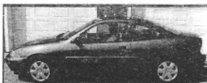
98 Chevy Cavalier, Runs Great Only $222 Down*