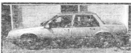
91 Buick Lesabre, Runs Great Only $55 Down*

LENOIR CITY AUTO SALES • 986-4411 • LENOIR CITY AUTO SALES • 986-4411 • LENOIR CITY AUTO SALES • 986-4411 • LENOIR CITY AUTO SALES • 986-4411 • LENOIR CITY AUTO SALES • 986-4411