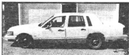
91 Lincoln Town Car, Luxury, Cold AC Only $77 Down*

NO CREDIT NEEDED! BAD CREDIT OK! NO TURNDOWNS! NO GIMMICKS!