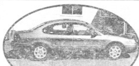
2004 Ford Taurus LX, AT, AC, Low Payments, Sale Price $6995