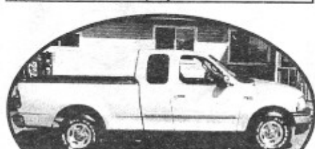
2001 Ford Ext. Cab, low miles, low payments, low down payment