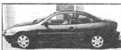
98 Chevy Cavalier, Runs Great Only $222 Down*