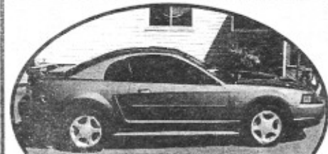
2002 Ford Mustang, Auto, AC, clean, Low down, low payments