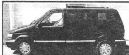
92 Dodge Caravan, Ready for Summer $66 Down*