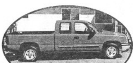
2004 Chevy Ext. Cab, auto, V8, AC, quad doors, low payments