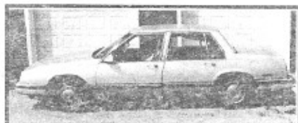
91 Buick Lesabre, Runs Great Only $55 Down*

Let us show you just How Easy it can be come by Today!!!