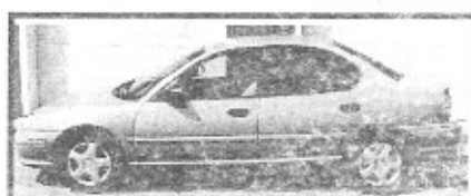
98 Dodge Neon, Cold AC Only $222 Down*