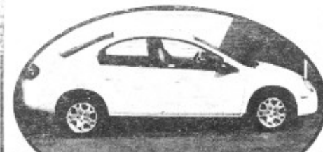
2005 Dodge Neon, 4dr, auto, AC, low miles $8995