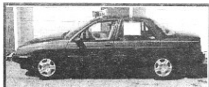
96 Chevy Corsica, Great Gas Mileage Only $99 Down*