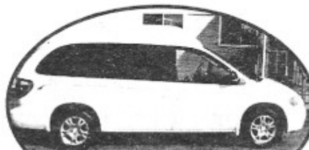
2003 Dodge Conversion Van, Low Miles, Fully Loaded. $13,995