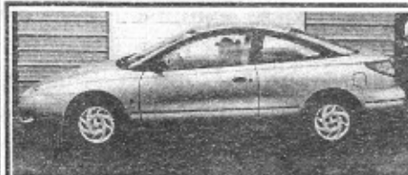
Saturn SC II, Auto, PW, PL, tilt, cruise, Runs Great only $500 down*