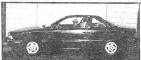
Achieva, auto, AC, 4cyl, Great on Gas only $99 down & $59/week*