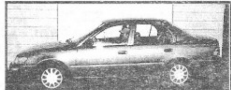
Corolla, all factory equip., 5sp, Great Car only $500 down & $65/week*