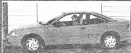
Cavalier, auto, AC, FM/Cass, runs great only $99 Down & $59/week*