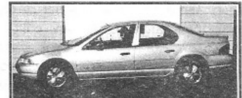
Breeze, auto, AC, PW, PL, Tilt, cruise only $499 Down*