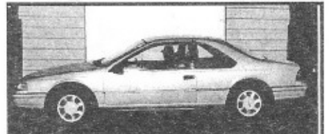
Thunderbird, auto, AC, tilt, cruise, FM/Cass only $199 down & $59/week*