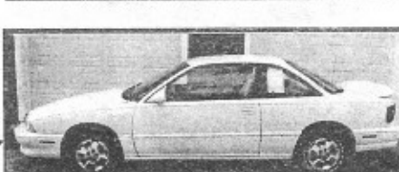
92 Olds Achieva, auto, 4cyl, Runs Great Only $199 down*