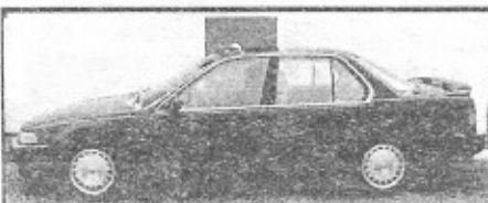
91 Honda Accord, ex. loaded, sunroof Only $499 down*

Use Your Expected Tax Refund Today and We Pay for your Tax preparation*