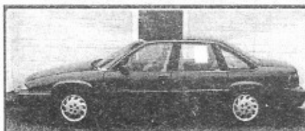
93 Pontiac Grand Prix, 4dr, auto, nice Only $299 down*