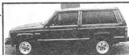
94 Jeep Cherokee, 2dr, 5sp, Runs Great Only $299 down*

NO CREDIT NEEDED! BAD CREDIT OK! NO TURNDOWNS! NO GIMMICKS!