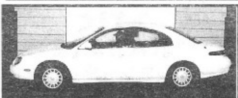
Sable, all power, V6, Runs Great, only $500 Down & $65/week*