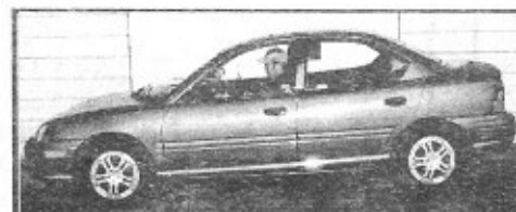
Neon, 5sp, FM/Cass, Nice Car, only $500 down & $65/week*