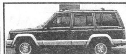
93 Jeep Cherokee, 4dr, auto, 4x4, country Only $499 down*