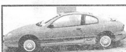
96 Pontiac Sunfire, auto, sporty, Only $499 down*