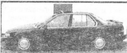
91 Honda Accord, ex. loaded, sunroof Only $499 down*

LENOIR CITY AUTO SALES • 986-4411 • LENOIR CITY AUTO SALES • 986-4411 • LENOIR CITY AUTO SALES • 986-4411 • LENOIR CITY AUTO SALES • 986-4411 • LENOIR CITY AUTO SALES • 986-4411