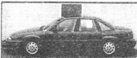
93 Pontiac Grand Prix, 4dr, auto, nice Only $299 down*