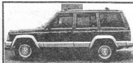
93 Jeep Cherokee, 4dr, auto, 4x4, country Only $499 down*