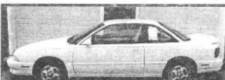
92 Olds Achieva, auto, 4cyl, Runs Great Only $199 down*