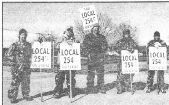
More members of the local union are represented on the picket line

Currently the union represents approximately 264 members and the company's major customer is Ford OES.