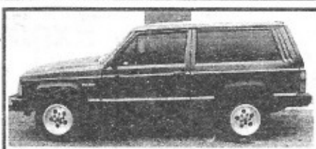
94 Jeep Cherokee, 2dr, 5sp, Runs Great Only $299 down*

NO CREDIT NEEDED! BAD CREDIT OK! NO TURNDOWNS! NO GIMMICKS!