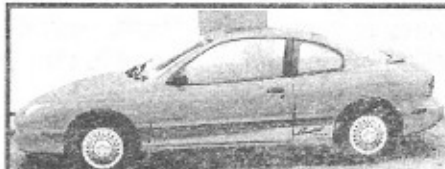
96 Pontiac Sunfire, auto, sporty, Only $499 down*

Use Your Expected Tax Refund Today and We Pay for your Tax preparation*