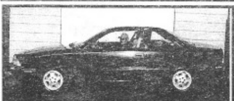
Achieva, auto, AC, 4cyl, Great on Gas only $99 down & $59/week*