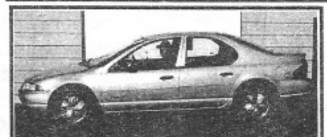
Breeze, auto, AC, PW, PL, Tilt, cruise only $499 Down*