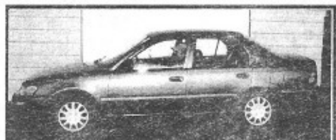
Corolla, all factory equip., 5sp, Great Car only $500 down & $65/week*