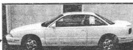
92 Olds Achieva, auto, 4cy, Runs Great Only $199 down*