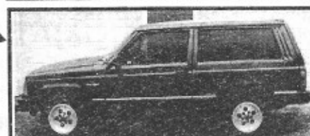
94 Jeep Cherokee, 2dr, 5sp, Runs Great Only $299 down*

NO CREDIT NEEDED! BAD CREDIT OK! NO TURNDOWNS! NO GIMMICKS!