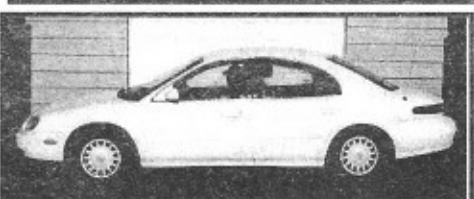
Sable, all power, V6, Runs Great, only $500 Down & $65/week*