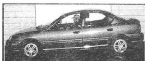
Neon, 5sp, FM/Cass, Nice Car, only $500 down & $65/week*