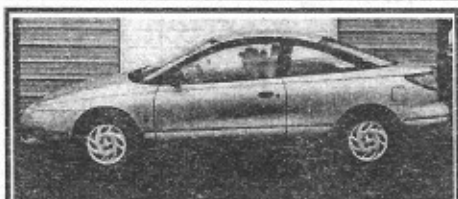
Saturn SC II, Auto, PW, PL, tilt, cruise, Runs Great only $500 down*