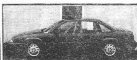
93 Pontiac Grand Prix, 4dr, auto, nice Only $299 down*