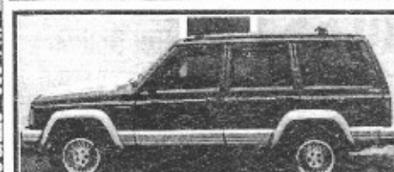
93 Jeep Cherokee, 4dr, auto, 4x4, country Only $499 down*