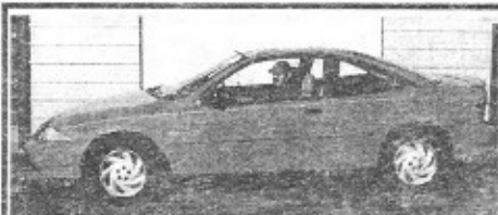
Cavalier, auto, AC, FM/Cass, runs great only $99 Down & $59/week*

MARTY'S AUTO SALES • 986-2222 • MARTY'S AUTO SALES • 986-2222 • MARTY'S AUTO SALES • 986-2222 • MARTY'S AUTO SALES • 986-2222 • MARTY'S AUTO SALES • 986-2222