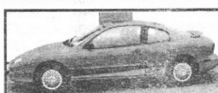
96 Pontiac Sunfire, auto, sporty, Only $499 down*