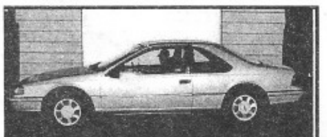
Thunderbird, auto, AC, tilt, cruise, FM/Cass only $199 down & $59/week*