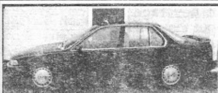
91 Honda Accord, ex. loaded, sunroof Only $499 down*

LENOIR CITY AUTO SALES • 986-4411 • LENOIR CITY AUTO SALES • 986-4411 • LENOIR CITY AUTO SALES • 986-4411 • LENOIR CITY AUTO SALES • 986-4411 • LENOIR CITY AUTO SALES • 986-4411 • LENOIR CITY AUTO SALES • 986-4411