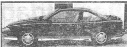
90 Chevy Z24, V6, auto, runs great Only $399 down*