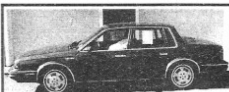
86 Olds Cutlass, V6, auto, Xtra low miles Only $199 down*