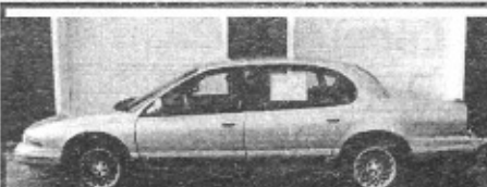
94 Chrysler LHS, Luxury, Top of the Line Only $299 down*