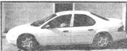
97 Dodge Stratus, auto, runs great Only $699 down*

LENOIR CITY AUTO SALES • 986-4411 • LENOIR CITY AUTO SALES • 986-4411 • LENOIR CITY AUTO SALES • 986-4411 • LENOIR CITY AUTO SALES • 986-4411 • LENOIR CITY AUTO SALES • 986-4411 • LENOIR CITY AUTO SALES • 986-4411