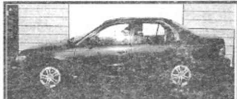
Corolla, 5sp, Great Gas Mileage, runs great only $500 down*