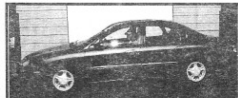
Taurus, auto, AC, all power equipment only $500 down*