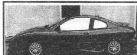
98 Pontiac Sunfire, auto, Fast & Furious Style Only $699 down*