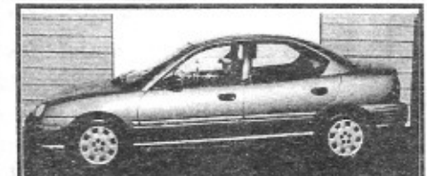
Neon, auto, AC, loaded, runs great only $499 Down*