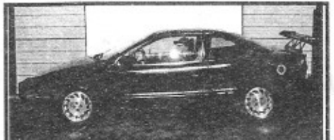
Saturn, 5sp, runs great, new paint, only $499 down*