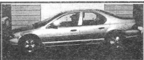
Breeze, auto, AC, loaded, Runs & Drives Great only $399 Down*