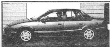
Saturn, 4dr, sunroof, auto, AC, PW, PL, tilt, only $500 down*