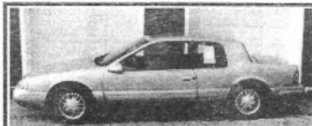
96 Mercury Cougar, Loaded, low miles Only $499 down*