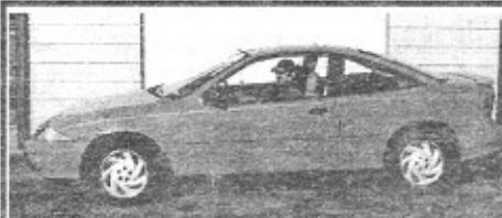
Cavalier, auto, AC, FM/Cass, runs great only $500 Down & $59/week*

MARTY'S AUTO SALES • 986-2222 • MARTY'S AUTO SALES • 986-2222 • MARTY'S AUTO SALES • 986-2222 • MARTY'S AUTO SALES • 986-2222 • MARTY'S AUTO SALES • 986-2222