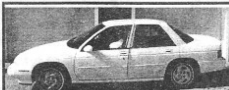
96 Chevy Corsica, V6, low miles, NICE Only $499 down*

NO CREDIT NEEDED! BAD CREDIT OK! NO TURNDOWNS! NO GIMMICKS!