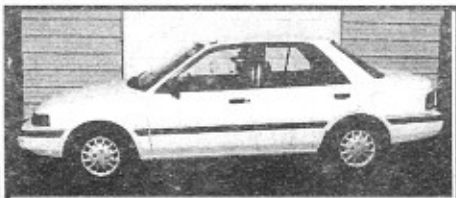
Protege, 5sp, great gas mileage, all factory equip. only $399 down*