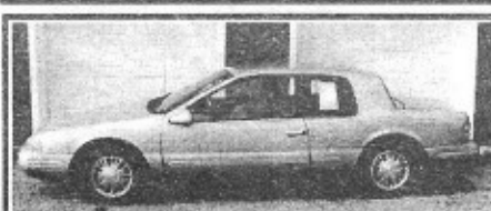
96 Mercury Cougar, Loaded, low miles Only $499 down*