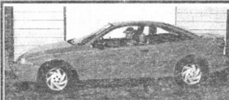
Cavalier, auto, AC, FM/Cass, runs great only $500 Down & $59/week*

MARTY'S AUTO SALES • 986-2222 • MARTY'S AUTO SALES • 986-2222 • MARTY'S AUTO SALES • 986-2222 • MARTY'S AUTO SALES • 986-2222 • MARTY'S AUTO SALES • 986-2222 • MARTY'S AUTO SALES • 986-2222