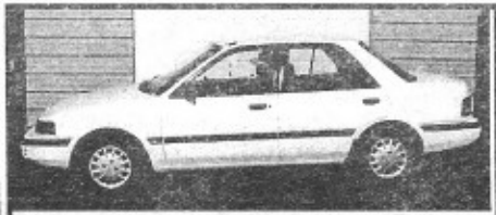
Protege, 5sp, great gas mileage, all factory equip. only $399 down*