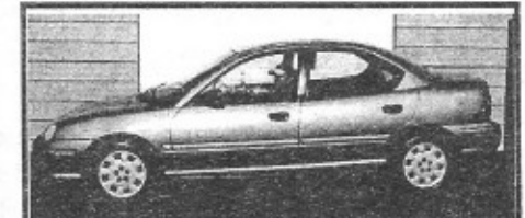
Neon, auto, AC, loaded, runs great only $499 Down*