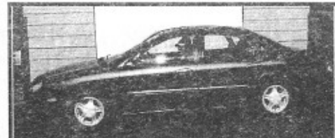
Taurus, auto, AC, all power equipment only $500 down*