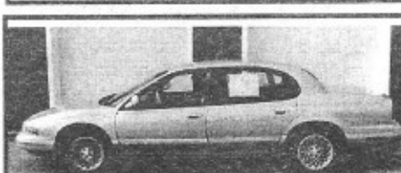
94 Chrysler LHS, Luxury, Top of the Line Only $299 down*