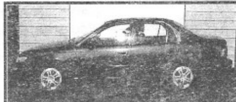
Corolla, 5sp, Great Gas Mileage, runs great only $500 down*