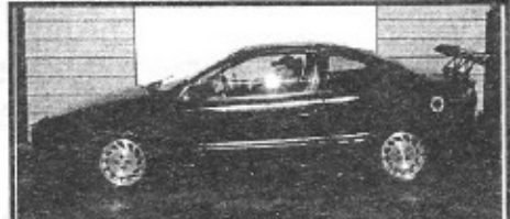
Saturn, 5sp, runs great, new paint, only $499 down*