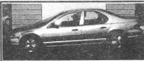
Breeze, auto, AC, loaded, Runs & Drives Great only $399 Down*