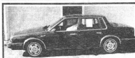
86 Olds Cutlass, V6, auto, Xtra low miles Only $199 down*

NO CREDIT NEEDED! BAD CREDIT OK! NO TURNDOWNS! NO GIMMICKS!