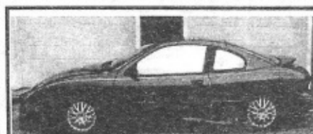
98 Pontiac Sunfire, auto, Fast & Furi- ous Style Only $699 down*