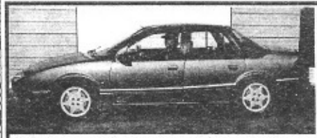
Saturn, 4dr, sunroof, auto, AC, PW, PL, tilt, only $500 down*