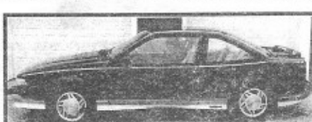
90 Chevy Z24, V6, auto, runs great Only $399 down*