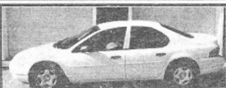
97 Dodge Stratus, auto, runs great Only $699 down*

LENOIR CITY AUTO SALES • 986-4411 • LENOIR CITY AUTO SALES • 986-4411 • LENOIR CITY AUTO SALES • 986-4411 • LENOIR CITY AUTO SALES • 986-4411 • LENOIR CITY AUTO SALES • 986-4411