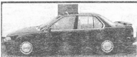
91 Honda Accord, ex. loaded, sunroof Only $499 down*

1200: 617 000 5015 938240 1200: 617 000 5015 938240 1200: 617 000 5015 938240 1200: 617 000 5015 938240 1200: 617 000 5015 938240