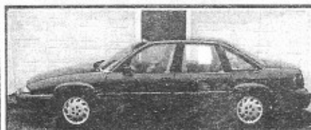
93 Pontiac Grand Prix, 4dr, auto, nice Only $299 down*