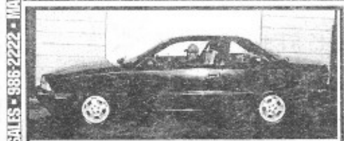
Achieva, auto, AC, 4cyl, Great on Gas only $99 down & $59/week*