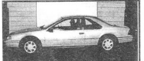
Thunderbird, auto, AC, tilt, cruise, FM/Cass only $199 down & $59/week*