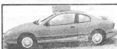
96 Pontiac Sunfire, auto, sporty, Only $499 down*

Use Your Expected Tax Refund Today and We Pay for your Tax preparation*