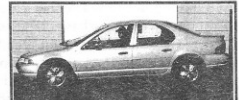
Breeze, auto, AC, PW, PL, Tilt, cruise only $499 Down*