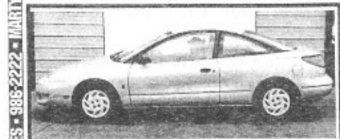
Saturn SC II, Auto, PW, PL, tilt, cruise, Runs Great only $500 down*