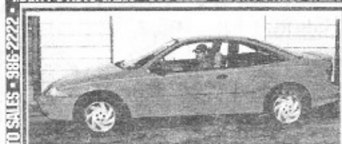
Cavalier, auto, AC, FM/Cass, runs great only $99 Down & $59/week*

MARTY'S AUTO SALES • 986-2222 • MARTY'S AUTO SALES • 986-2222 • MARTY'S AUTO SALES • 986-2222 • MARTY'S AUTO SALES • 986-2222 • MARTY'S AUTO SALES • 986-2222