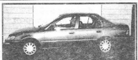
Corolla, all factory equip., 5sp. Great Car only $500 down & $65/week*