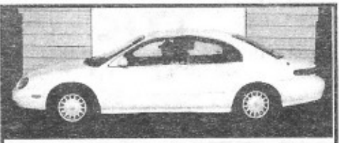
Sable, all power, V6, Runs Great, only $500 Down & $65/week*