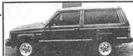
94 Jeep Cherokee, 2dr, 5sp, Runs Great Only $299 down*

NO CREDIT NEEDED! BAD CREDIT OK! NO TURNDOWNS! NO GIMMICKS!