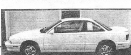
92 Olds Achieva, auto, 4cyl, Runs Great Only $199 down*