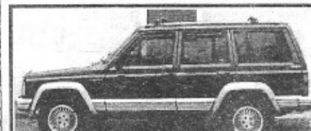
93 Jeep Cherokee, 4dr, auto, 4x4, country Only $499 down*