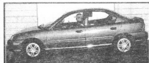
Neon, 5sp, FM/Cass, Nice Car, only $500 down & $65/week*