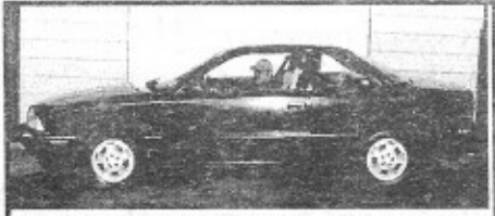
Achieva, auto, AC, 4cyl, Great on Gas only $99 down & $59/week*