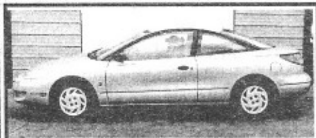
Saturn SC II, Auto, PW, PL, tilt, cruise, Runs Great only $500 down*