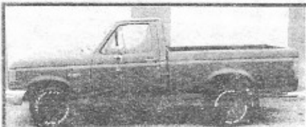
88 Ford F150, auto, runs great Only $499 down*

LENOIR CITY AUTO SALES • 986-4411 • LENOIR CITY AUTO SALES • 986-4411 • LENOIR CITY AUTO SALES • 986-4411 • LENOIR CITY AUTO SALES • 986-4411 • LENOIR CITY AUTO SALES • 986-4411