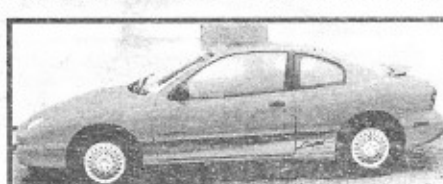
96 Pontiac Sunfire, auto, sporty, Only $499 down*