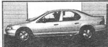
Breeze, auto, AC, PW, PL, Tilt, cruise only $499 Down*