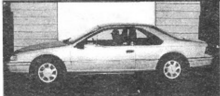
Thunderbird, auto, AC, tilt, cruise, FM/Cass only $199 down & $59/week*