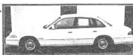
92 Crown Vic, auto, Police pkg, Only $499 down*

NO CREDIT NEEDED! BAD CREDIT OK! NO TURNDOWNS! NO GIMMICKS!