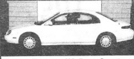
Sable, all power, V6, Runs Great, only $500 Down & $65/week*