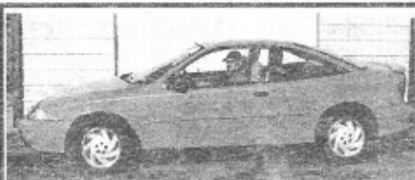
Cavalier, auto, AC, FM/Cass, runs great only $99 Down & $59/week*

MARTY'S AUTO SALES • 986-2222 • MARTY'S AUTO SALES • 986-2222 • MARTY'S AUTO SALES • 986-2222 • MARTY'S AUTO SALES • 986-2222 • MARTY'S AUTO SALES • 986-2222