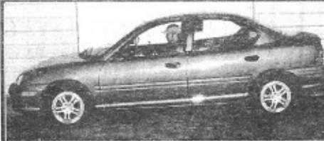
Neon, 5sp, FM/Cass, Nice Car, only $500 down & $65/week*