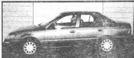
Corolla, all factory equip., 5sp, Great Car only $500 down & $65/week*