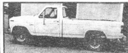
84 Ford F250, auto, V8, Great Work Truck Only $399 down*