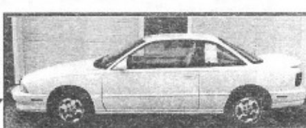
92 Olds Achieva, auto, 4cyl, Runs Great Only $199 down*