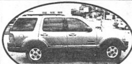
2002 Ford Explorer XLT, tan, 4x4, 3rd row seat, LOADED