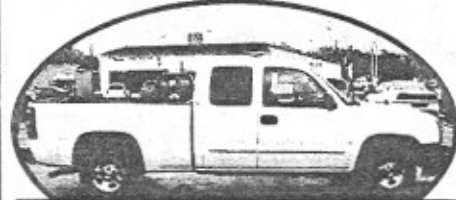
2003 Chevy Silverado, ex. cab, V8, auto, LOW MILES