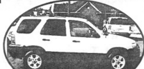
2003 Kia Sedona, loaded, dual sliding doors, Capt. Chairs, Low Miles