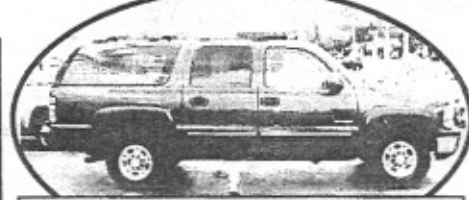
2000 Chevy Suburban, blue, 4x4, 3rd row seat, 3/4 ton, LOW MILES