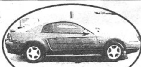
2003 Ford Mustang, auto, AC, loaded, LOW PAYMENTS