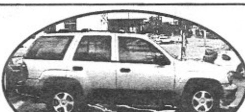
2003 Chevy Trailblazer, tan, LOADED, Great Payments