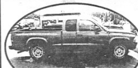
2004 Dakota Club Cab, low miles, auto, V6, LOW PAYMENTS